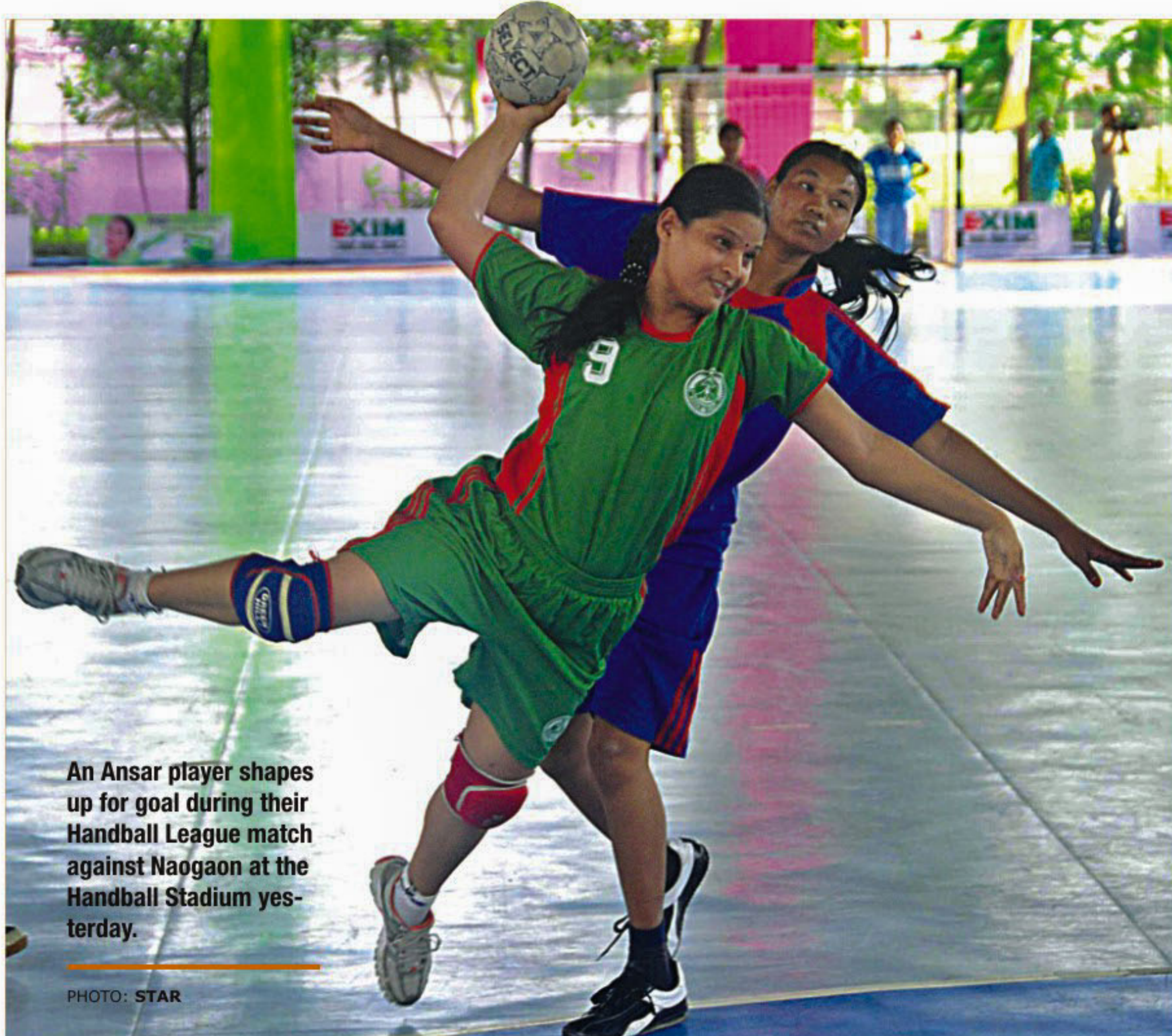
An Ansar player shapes up for goal during their Handball League match against Naogaon at the Handball Stadium yesterday.