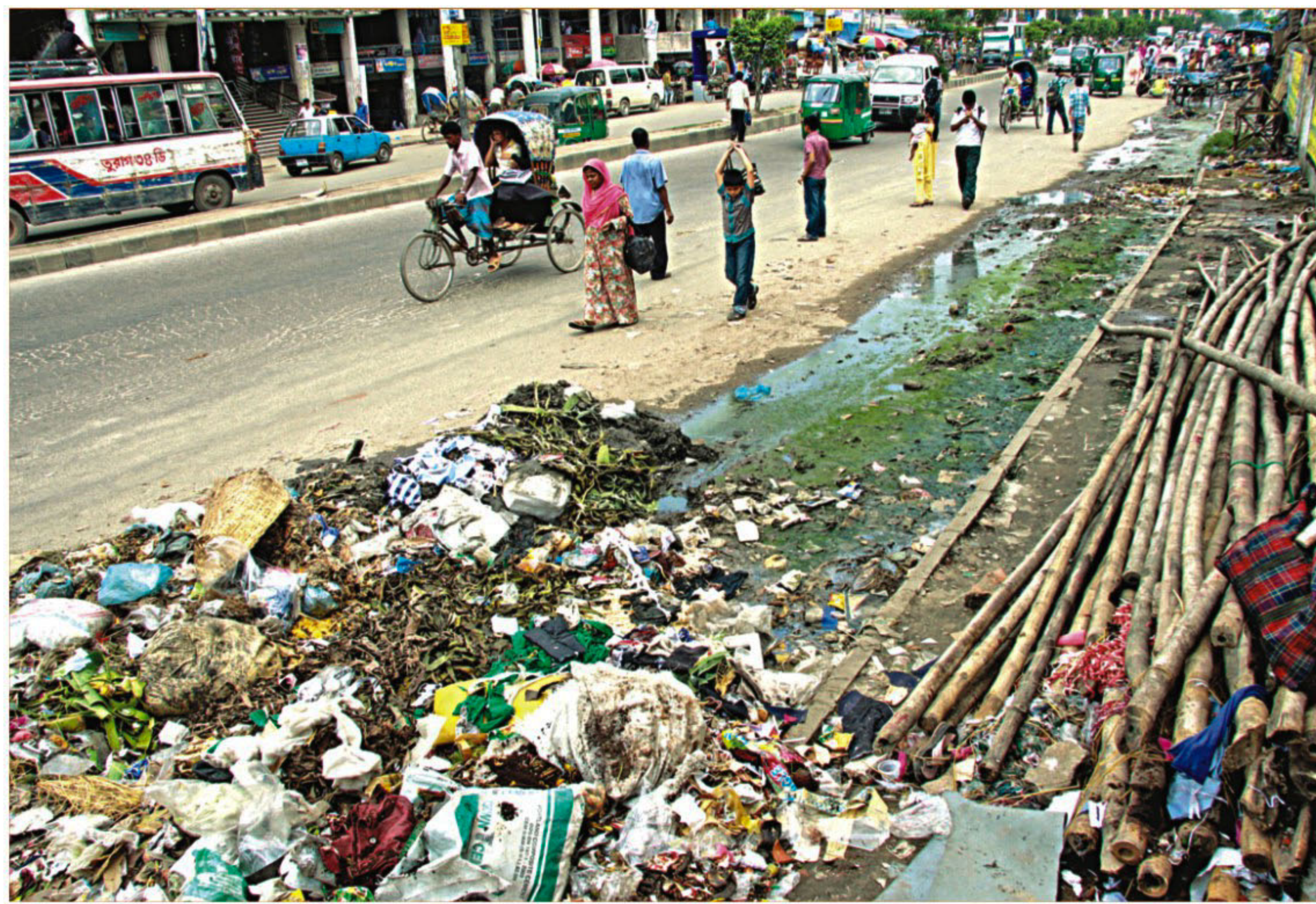
The footpath alongside the stretch of road between Malibagh and Khilgaon in the city lies littered with garbage, forcing pedestrians onto the traffic lanes. The photo was taken yesterday.

He also blamed the Rajdhani Unnayan Kartipakkha (Rajuk) for being reluctant about encroachment of walkways by various markets, shopping complexes and apartment buildings.