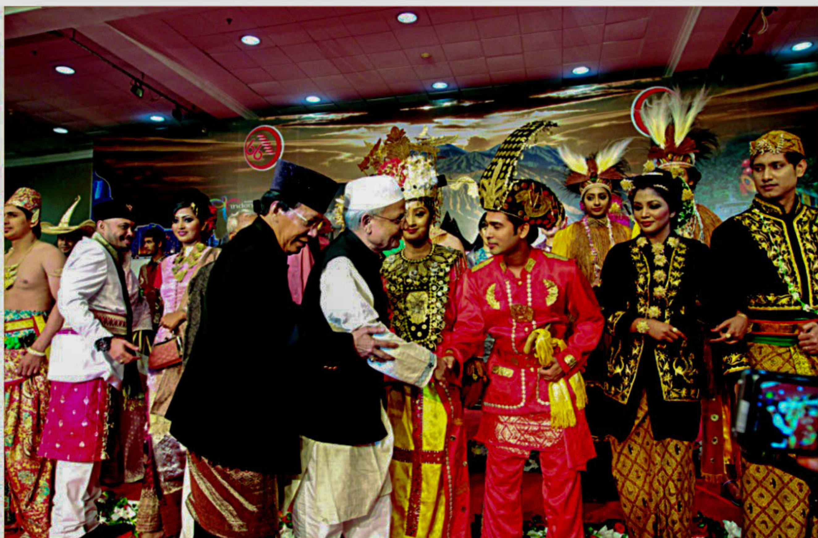
Indonesian Embassy in Dhaka arranges a fashion show on its wedding ceremony dresses at Ruposhi Bangla Hotel in the city Saturday night celebrating the 66th Anniversary of Independence of Indonesia.

GL Lead Auditor Jens Rogge presented the last keynote paper on "GL minimum standards for green ship recycling".