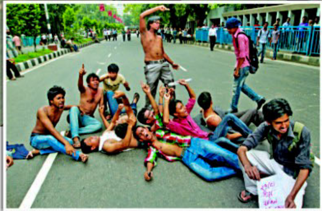
Police are trying to drag out Jagannath University's students who took to the street in front of the High Court in the city yesterday demanding government funding of the university and ridding its dorms of illegal occupiers. Inset , some of the students are obstructing vehicular movement sitting on the road. (Story on Page 20)