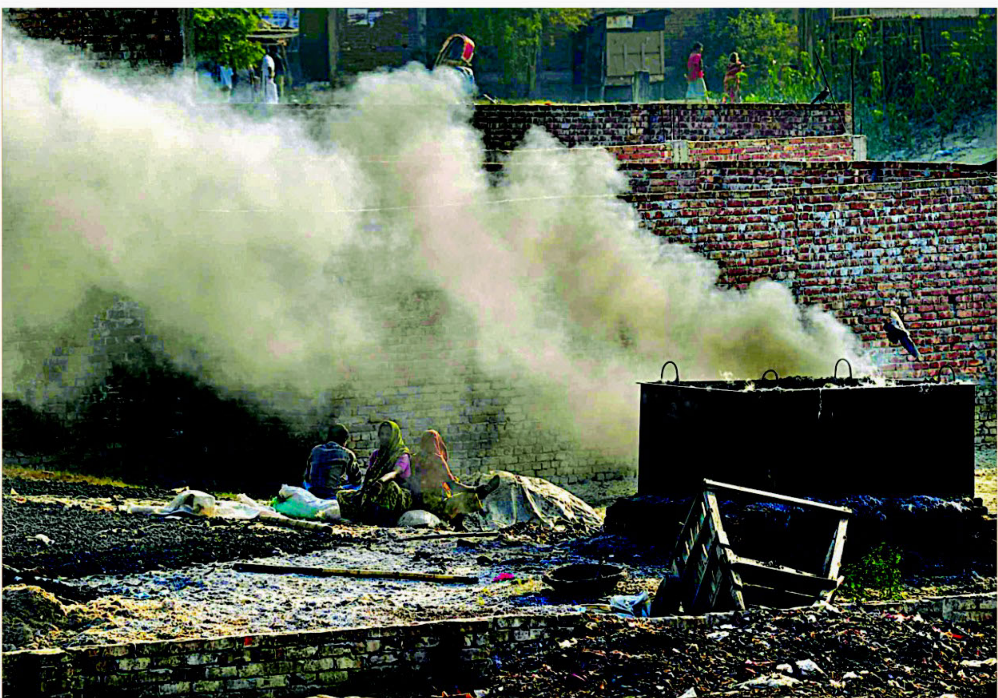
Discarded bits of animal hide are used for making poultry feed in Hazaribagh in the capital spreading a stinking fume in the neighbourhood and causing air pollution. The photo was taken recently.