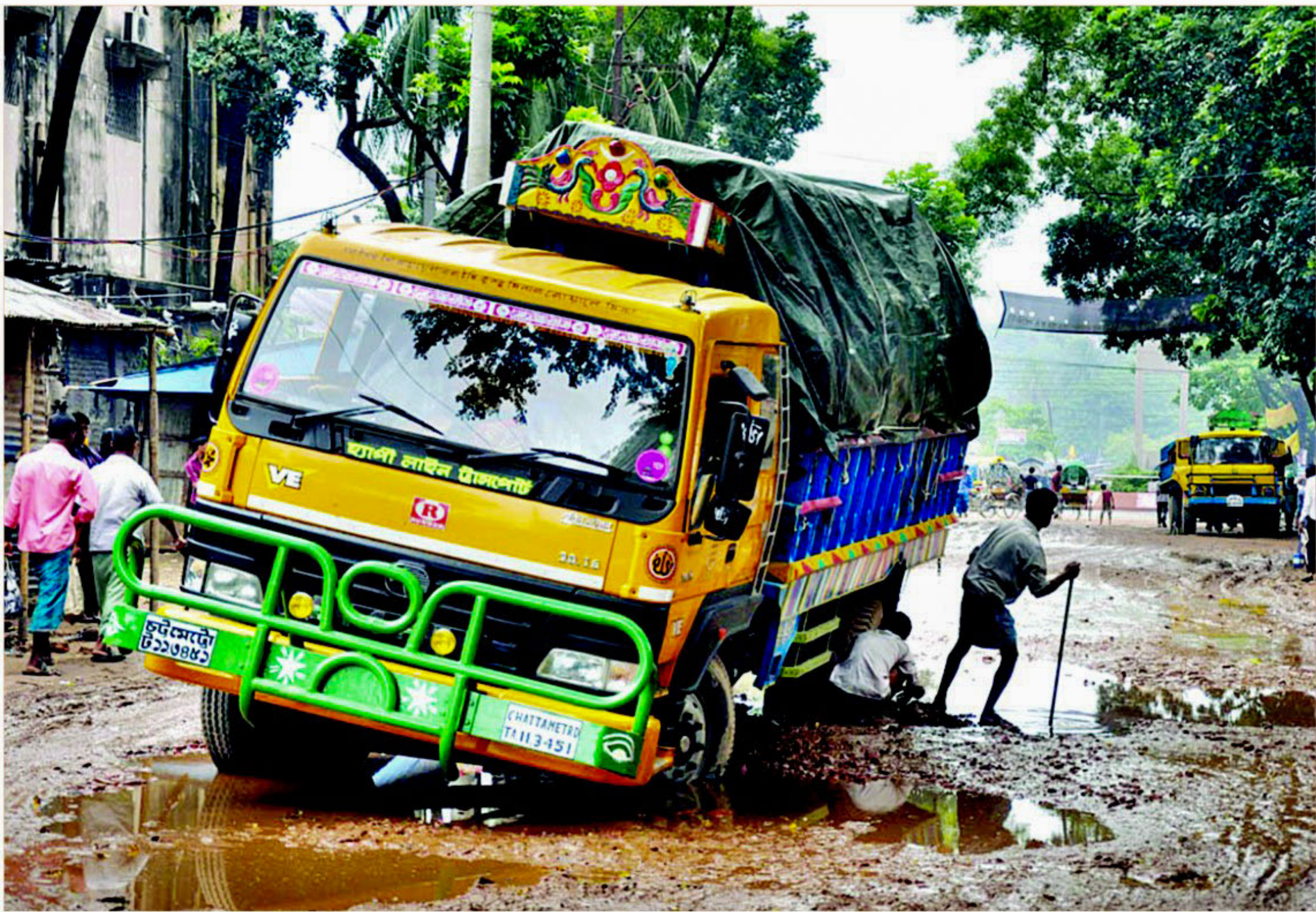
Even a truck with its huge wheels gets stuck on the road in front of Textile Gate in Bayezid Industrial Area of Chittagong. The authorities concerned not only failed to repair the road but also did not come to the aid of the two poor transport workers frantically trying to get the vehicle going again.