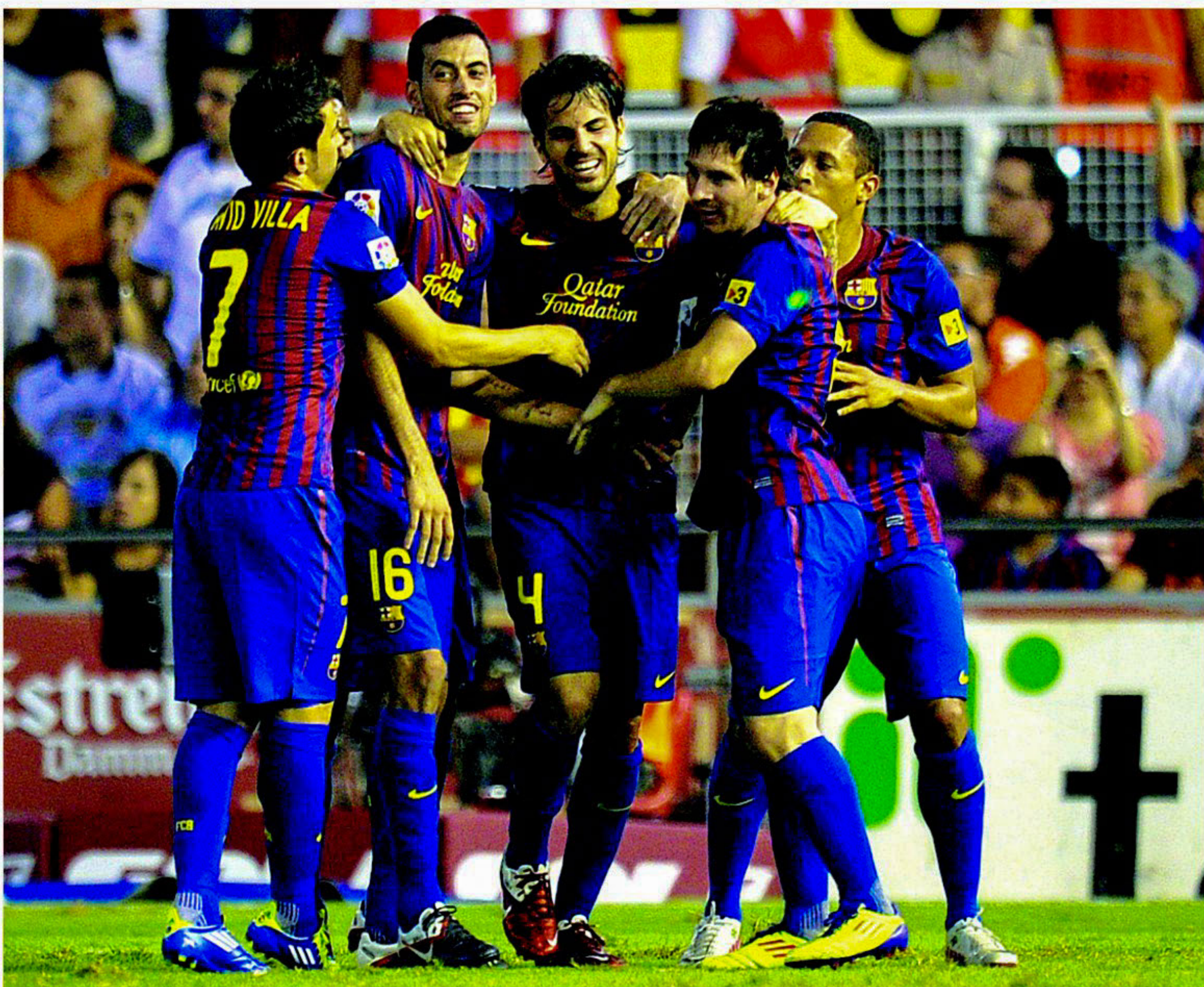
Barcelona midfielder Cesc Fabregas (C) is the toast of his teammates after scoring the equaliser against Valencia during their Primera Liga encounter at the Mestalla on Wednesday.

Elsewhere on Wednesday Atletico Madrid recorded their second successive 4-0 win as they beat pointless Sporting Gijon with Colombian striker Falcao scoring a double following on from his hattrick at the weekend.