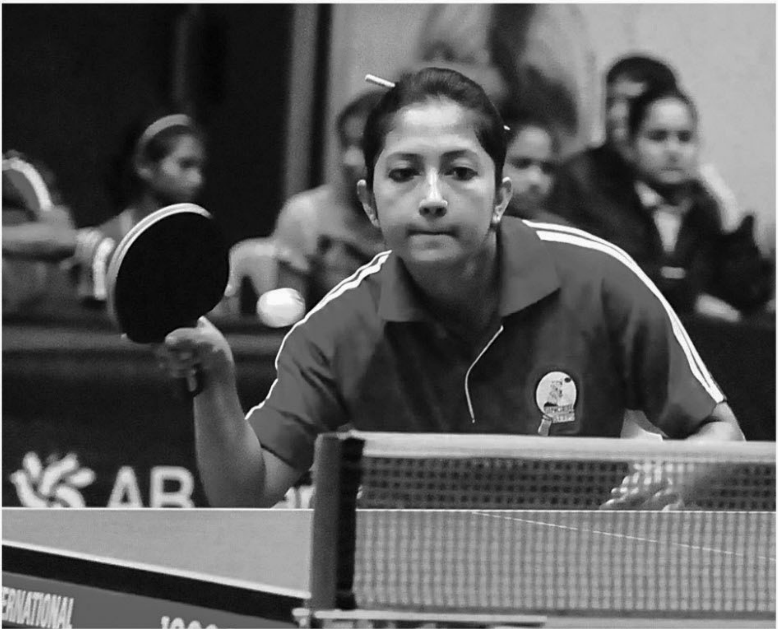
Top seed Soma of Abahani plays a forehand return against Turbina of Dhaka in the Federation Cup Invitational Table Tennis Tournament at the Wooden Floor Gymnasium yesterday.

Tendulkar had written a letter to the ICC to change the format of the ODIs from two innings of 50 overs to four of 25 overs like a Test match but the world council's Chief Executive Haroon Lorgat rejected it.