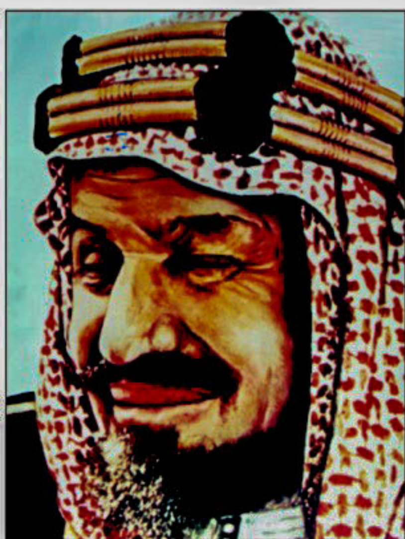
Late King Abdul Aziz Founder of the Kingdom of Saudi Arabia