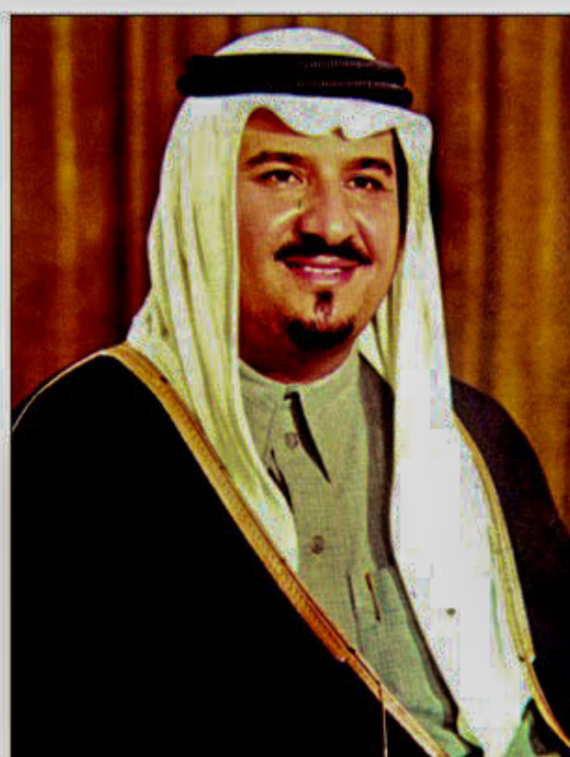
Crown Prince Sultan Bin Abdul Aziz