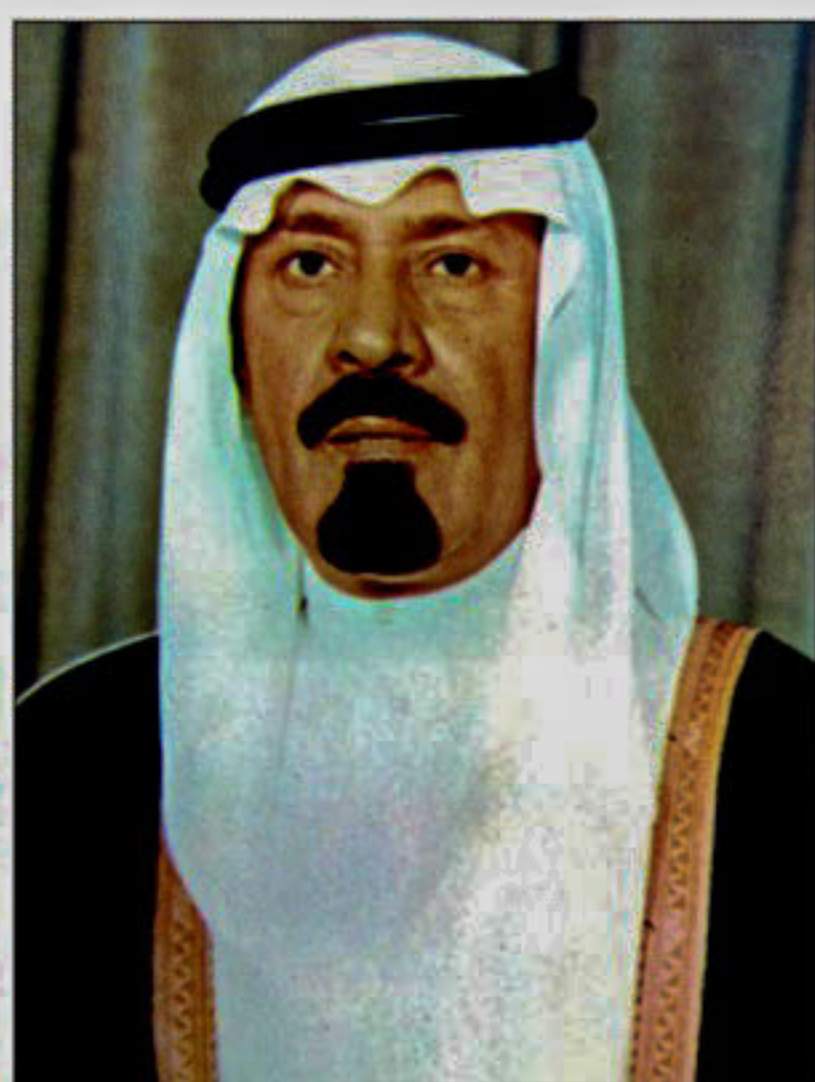
King Abdullah Bin Abdul Aziz Custodian of the Two Holy Mosques