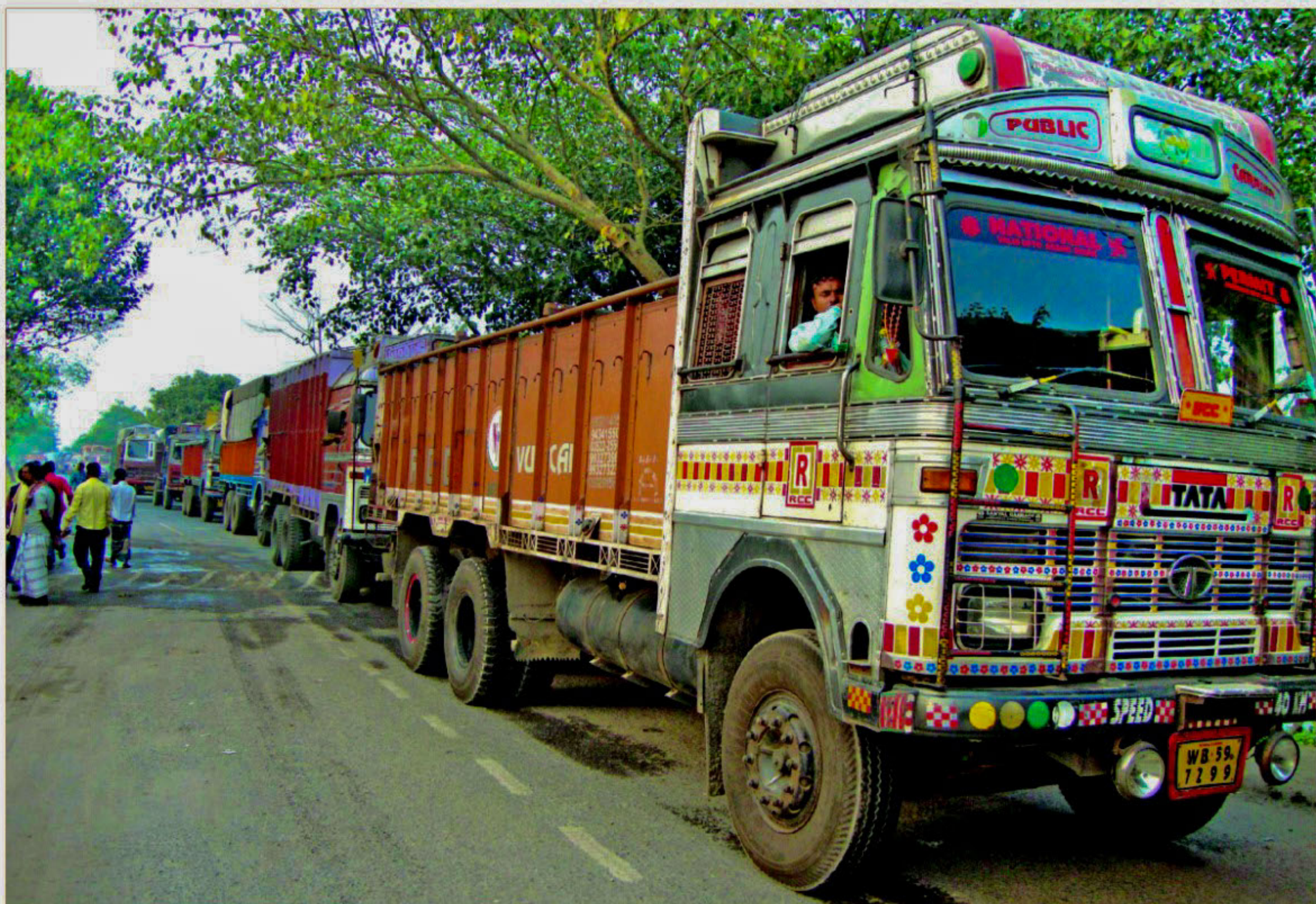
At least 50 trucks queue up at Burimari border in Lalmonirhat loaded with goods from Bhutan, India and Nepal. They arrived at the land port, unloaded, and left with goods from Bangladesh. However, due to the opposition's hartal yesterday, imported goods could not be sent to other parts of the country.