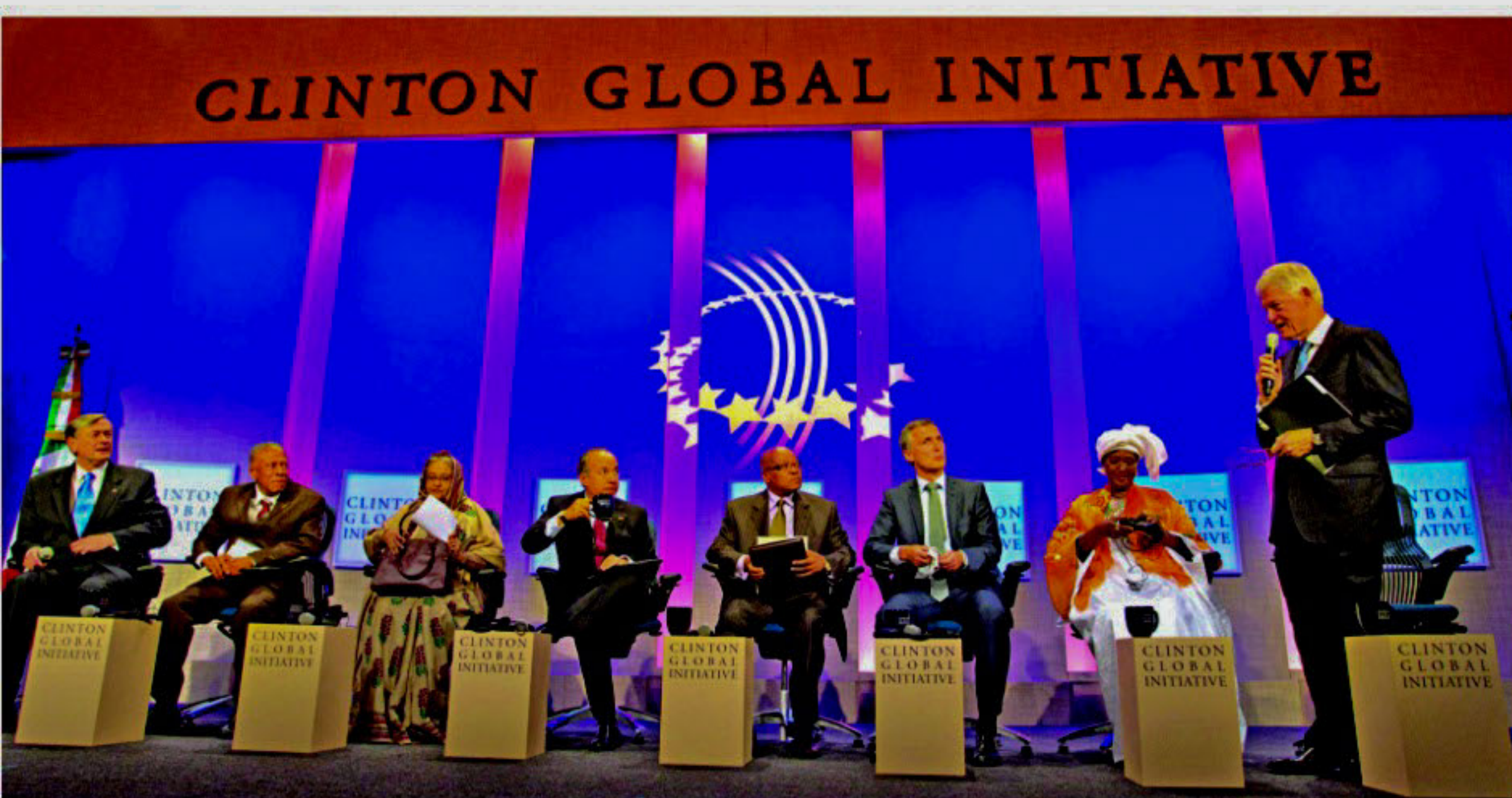
Former US president Bill Clinton, right, introduces President of Slovenia Danilo Turk, Prime Minister of Grenada Tillman Thomas, Prime Minister of Bangladesh Sheikh Hasina, President of Mexico Felipe Calderon, President of South Africa Jacob Zuma, Prime Minister of Norway Jens Stoltenberg, and Prime Minister of Mali Cisse Mariam Kaidama Sidibe during the opening plenary of the Clinton Global Initiative at a New York hotel on September 21.