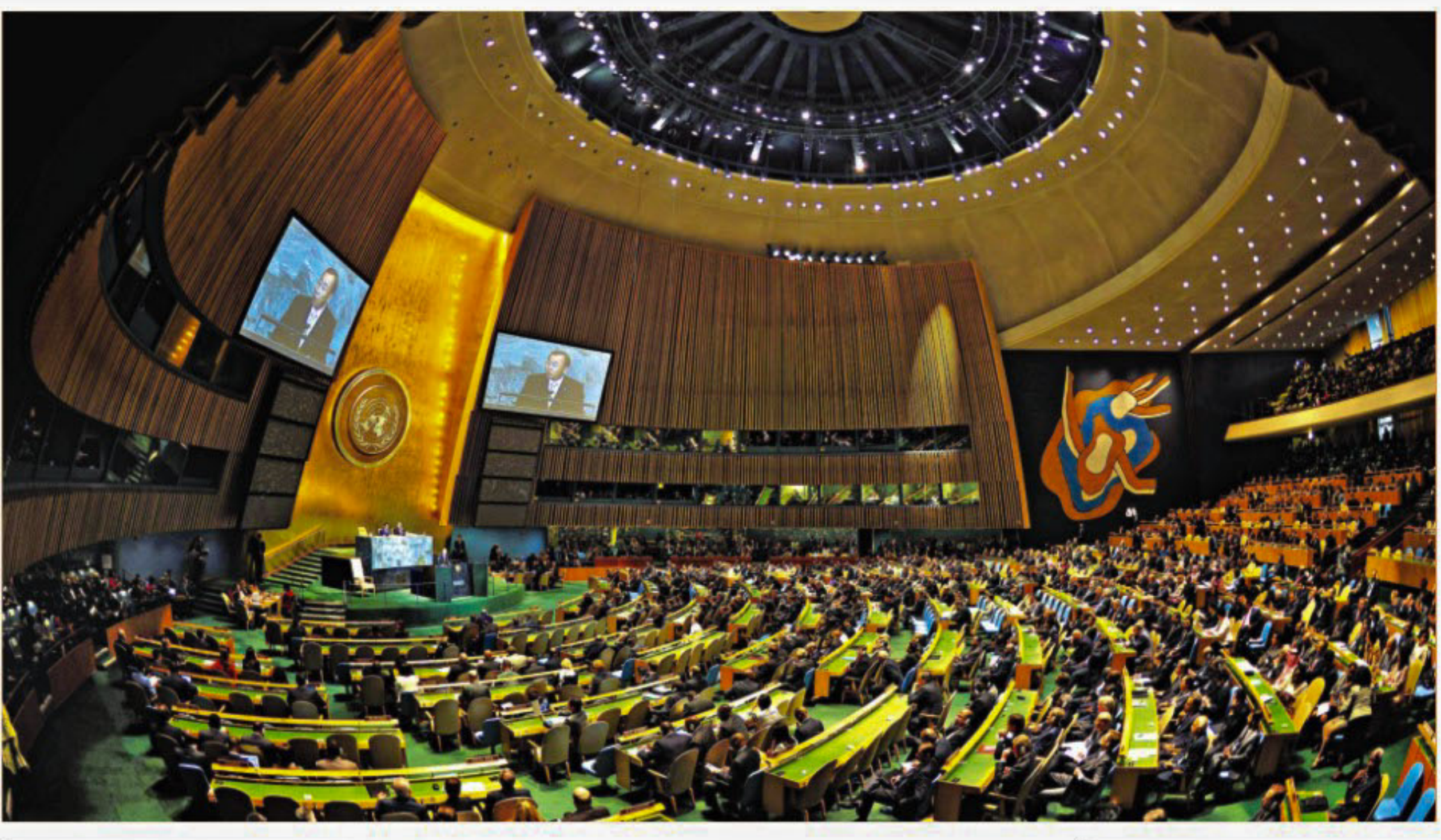
UN Secretary-General Ban Ki-moon addresses the 66th UN General Assembly at the United Nations headquarters in New York yesterday.