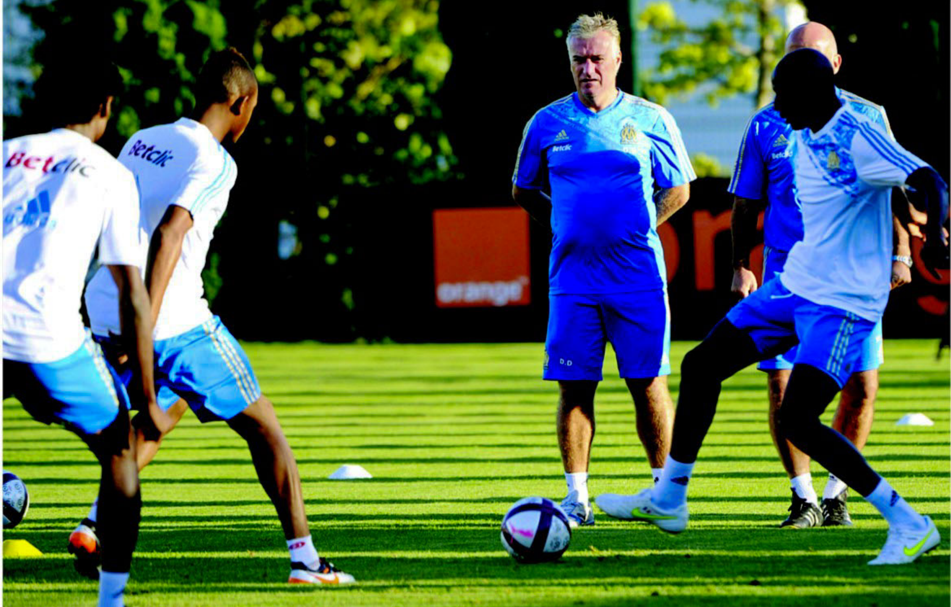
Marseille coach Didier Deschamps (C) conducts a training session at the Dreyfus training centre on Monday.

"I'm a believer, I'm not giving up," Deschamps said ahead of Marseille's midweek date with newly promoted Evian, who unlike their illustrious rivals on Wednesday have managed one win and are placed in midtable with seven points, four more than hapless Marseille.