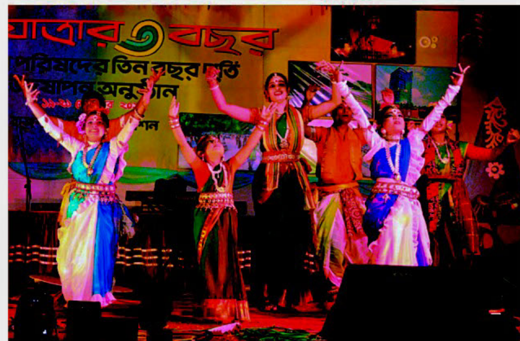
Artistes perform at the programme.