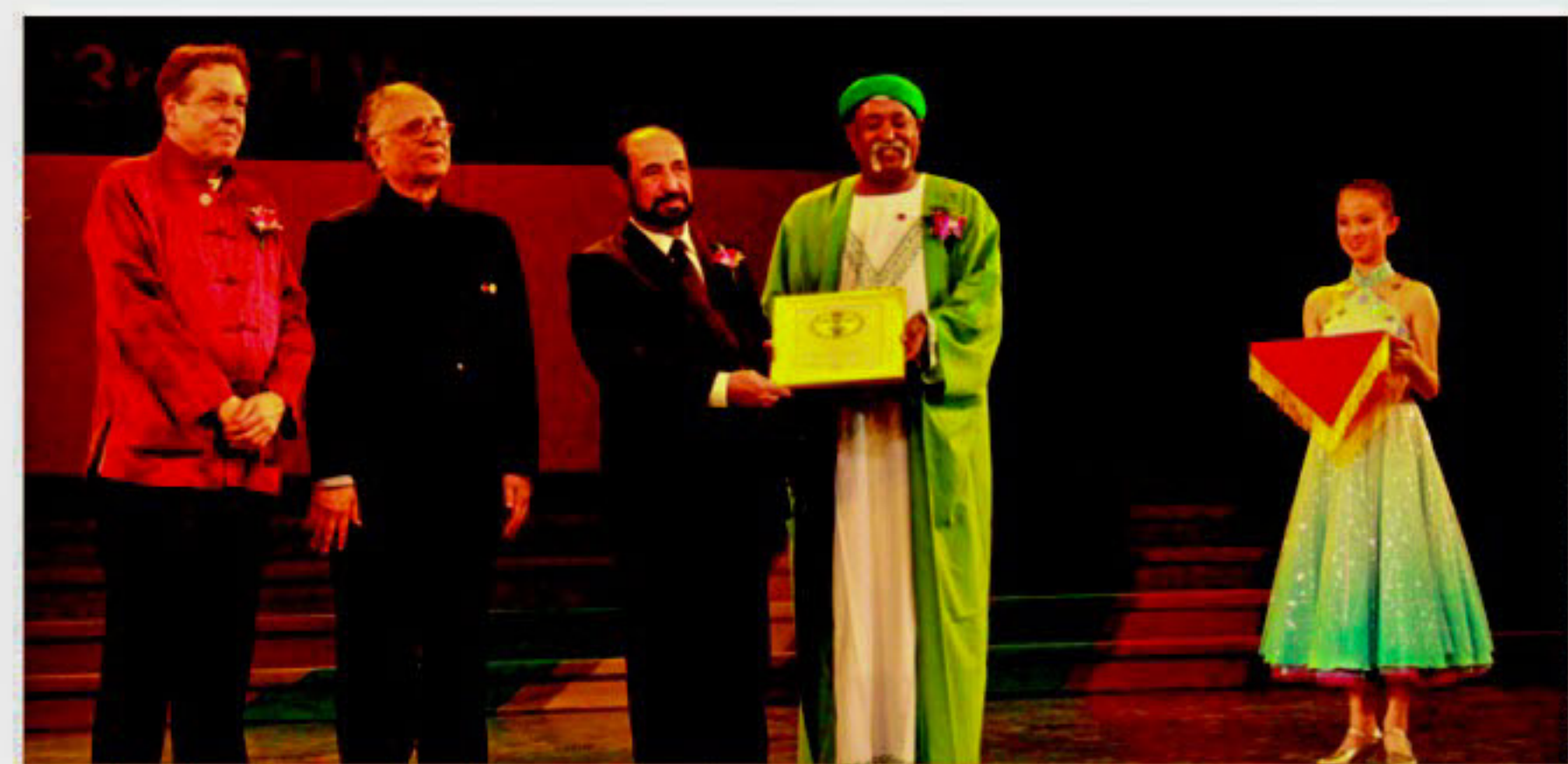
ITI leaders conferred the prestigious ITI Award to the ruler of Sharjah, Sheikh Dr. Sultan bin Mohammad Al-Qasimi at the inaugural session of ITI's 33rd Congress in Xiamen, China.