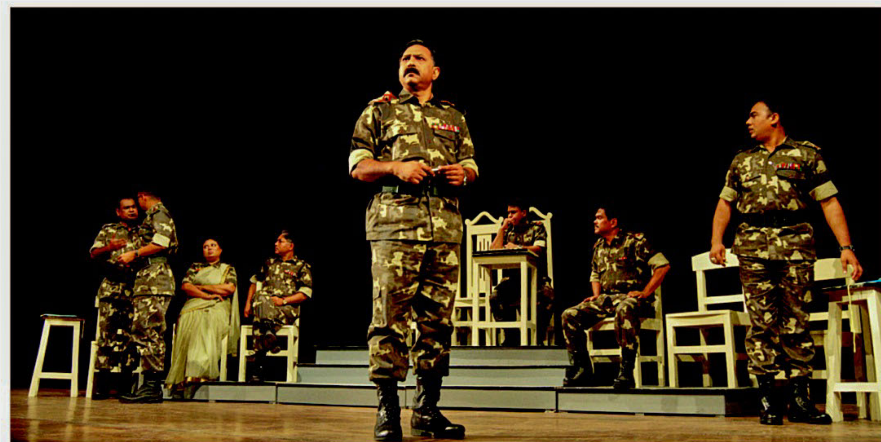
A scene from "Court Martial".