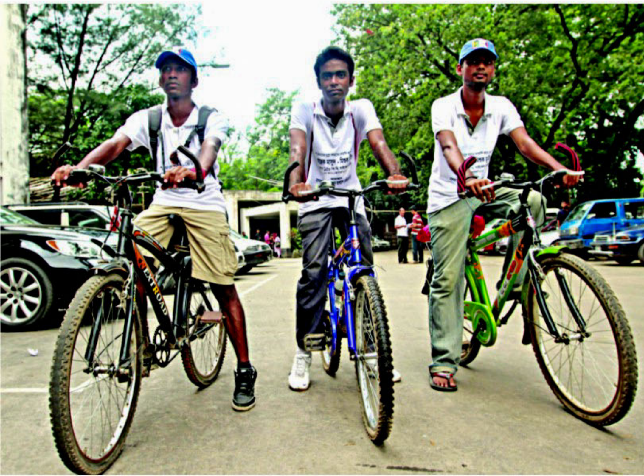
National Debate Federation launches a 150km cycle marathon from in front of the Jatiya Press Club in the city yesterday in memory of Mishuk Munier and Tareque Masud and to create awareness about road accidents.