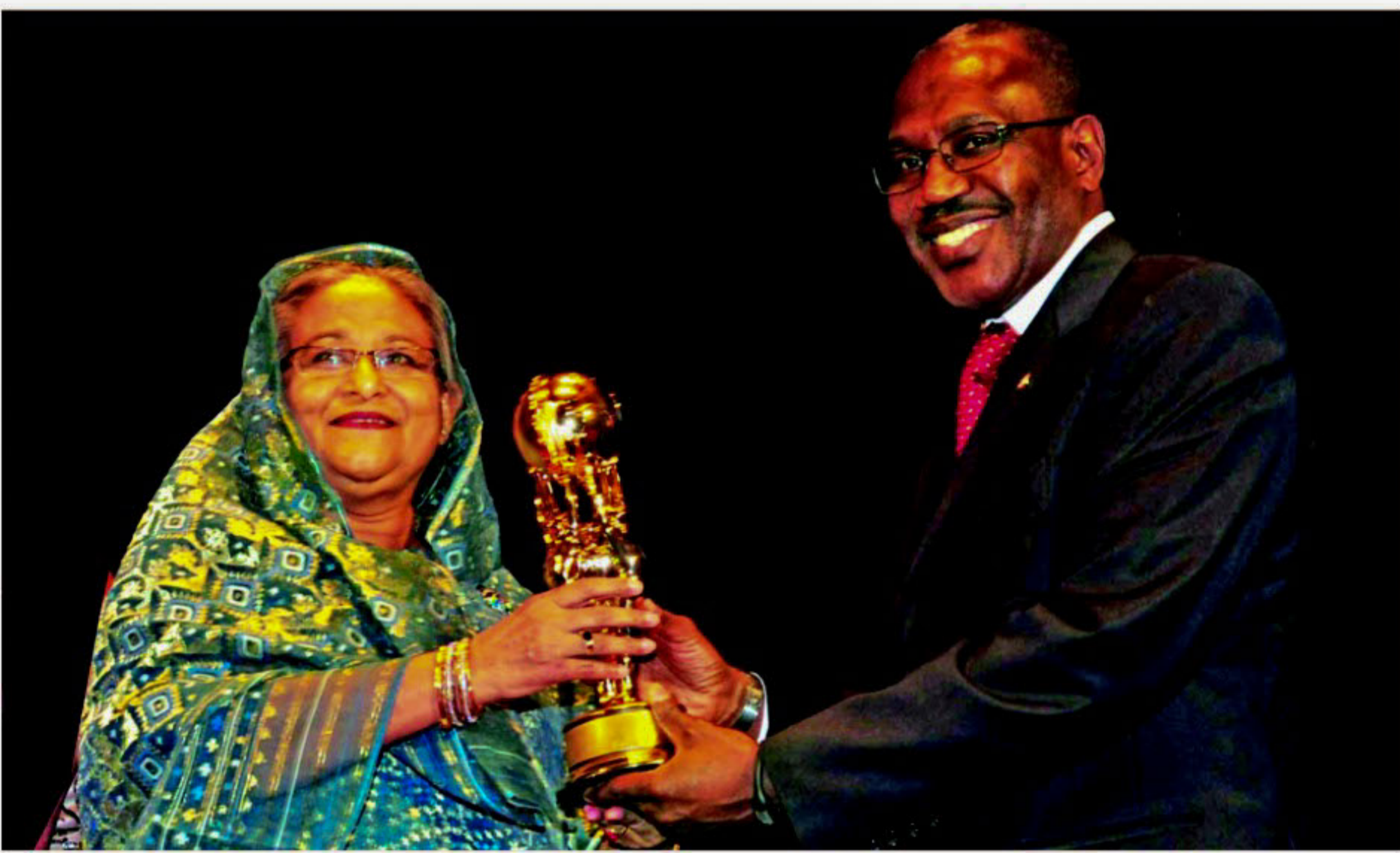
Prime Minister Sheikh Hasina receives Global Health and Children's Award at the Grand Ballroom of Waldorf Astoria Hotel in New York. Story on page 5.

STAFF CORRESPONDENT BNP high command was surprised to witness Monday's violent protest by its key ally Jamaat-e-Islami ahead of its September 27 rally from where the party chairperson is expected to announce agitation programmes. The issue of Jamaat's protest did not come up prominently in the SEE PAGE 6 COL 5