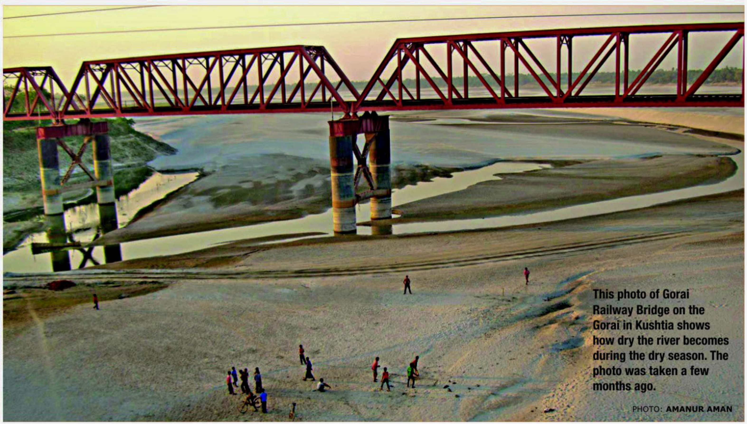
This photo of Gorai Railway Bridge on the Gorai in Kushtia shows how dry the river becomes during the dry season. The photo was taken a few months ago.