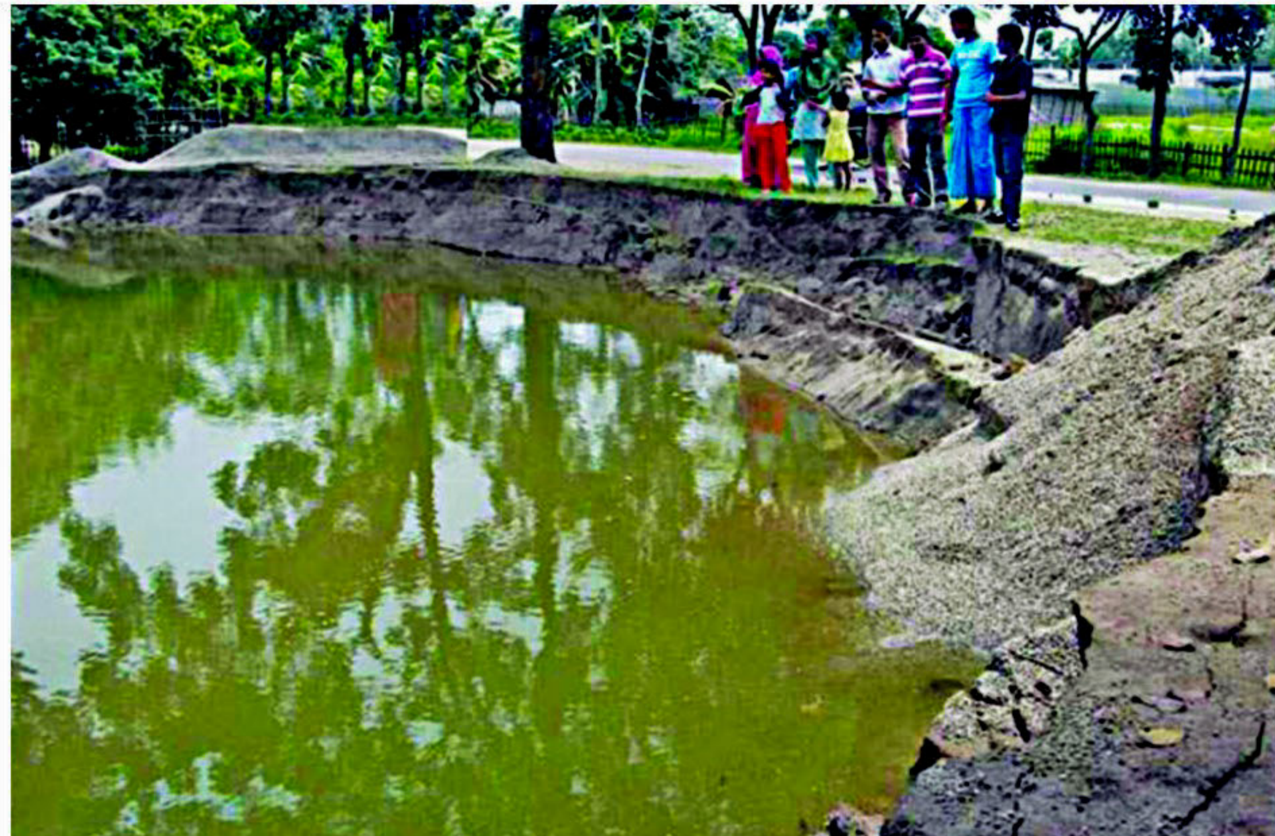
Filled up four months ago, this pond at Millgate in Dhakkamara union under Panchagarh Sadar upazila again turned into a small water body as huge earth subsided under the impact of the strong earthquake that hit the country on Sunday evening. Dozens of buildings developed cracks and quite a few walls collapsed in Panchagarh and Thakurgaon districts as the areas, being relatively nearer to the tremor epicentre in Sikkim, felt the jolt harder than other places of Bangladesh.