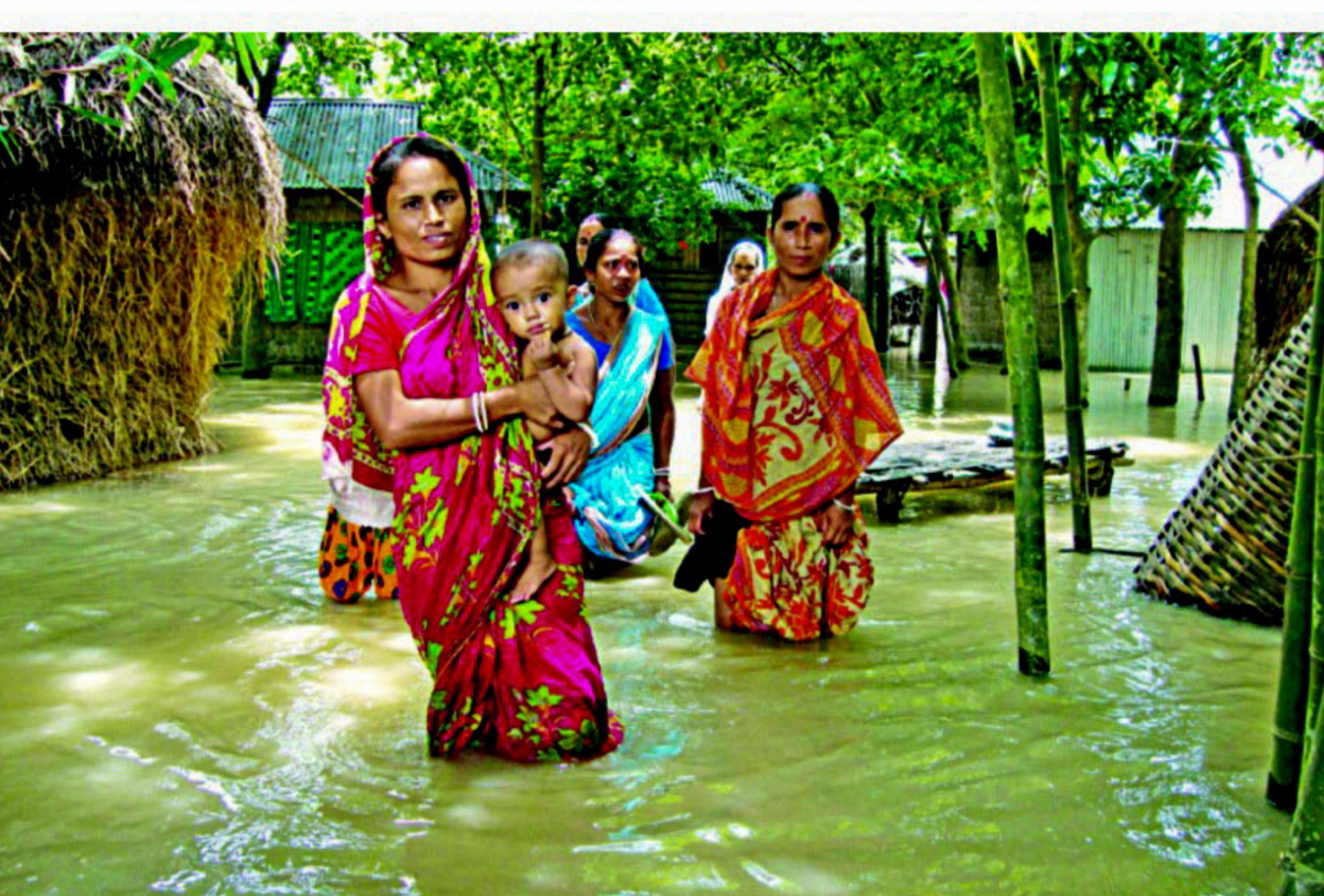
Women waded through knee-deep water at Etapota village in Mogholhat union under Lalmonirhat Sadar upazila yesterday as overflowing Teesta and Dharla rivers worsened flood situation in the district amid downpour for the last four days and onrush of water from the upstream.