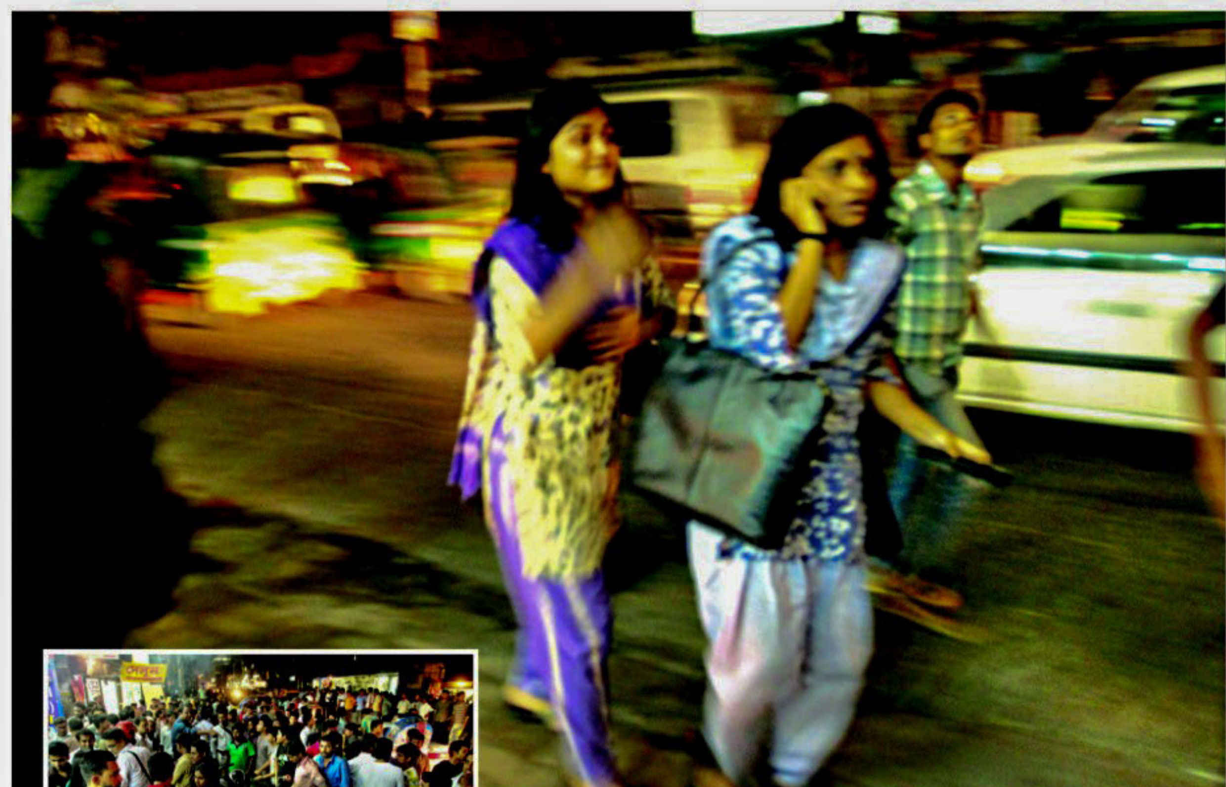
EVENING SHOCK: People run out their buildings and gather on the streets as a 6.8 magnitude earthquake sends a wave of panic across the capital and elsewhere in the country yesterday. The photos have been taken on Kazi Nazrul Islam Avenue and Green Road.