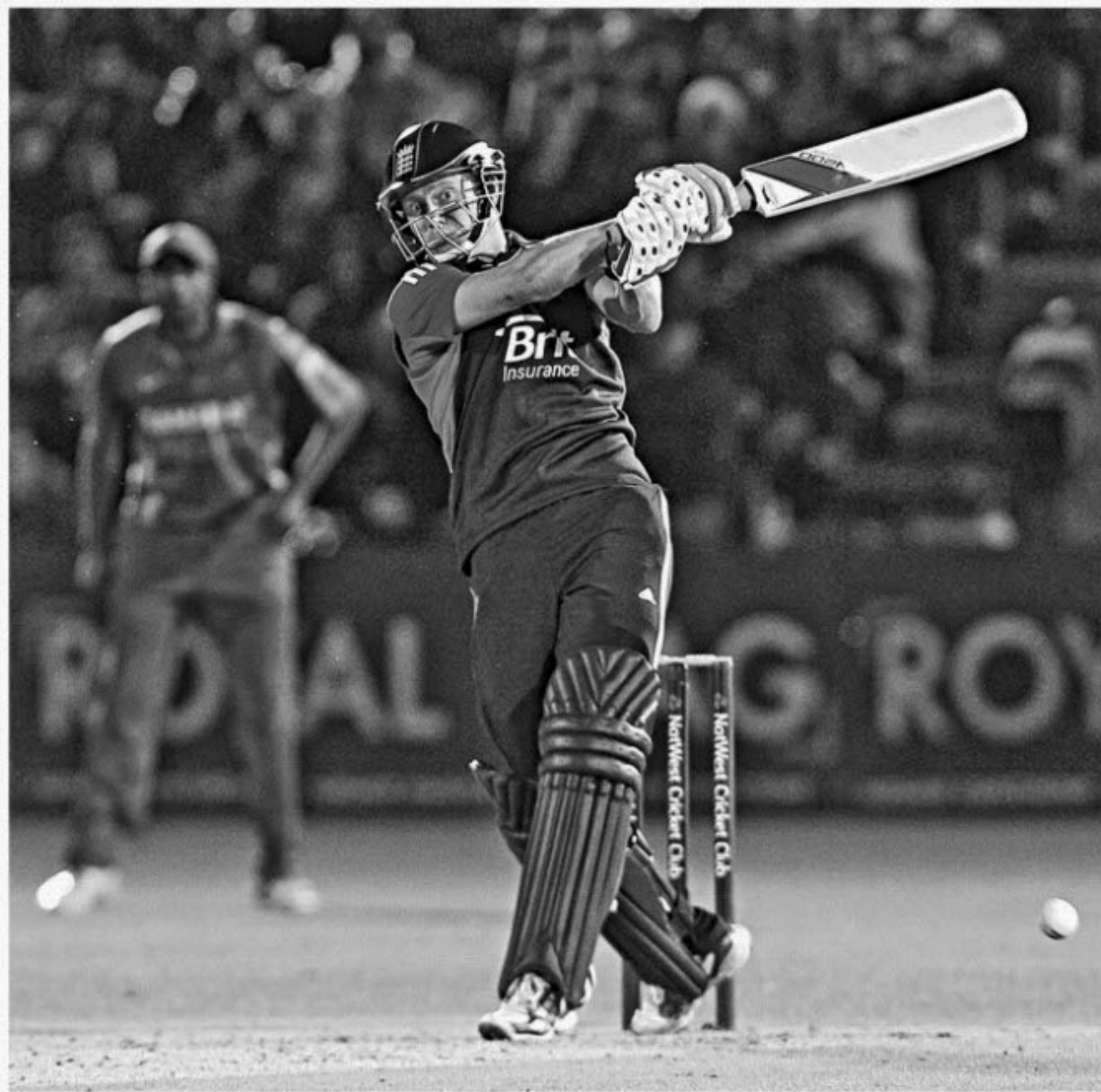
THE FINAL ACT: England debutant Jonny Bairstow hammers one down the ground during his sparkling 29-ball 41 in the fifth and final ODI against India at the Sophia Gardens in Cardiff on Friday, giving England a 3-0 win in the series.

But with two previous attempts to hold elections falling through after aggrieved ones of the 213 stakeholders took the matter to court, many feel it is not unlikely that someone might turn to the court again next morning or the day after.