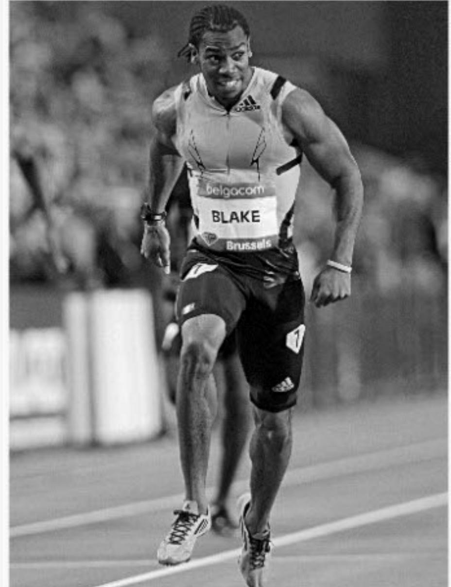
Jamaica's Yohan Blake is on his way to the second fastest 200m in history in the Diamond League event in Brussels on Friday. He sprinted home in 19.26sec, just behind the world record of 19.19sec held by Usain Bolt.

Blake sprinted home in 19.26sec, just behind the world record of 19.19sec held by Bolt, but overtaking Michael Johnson's mark