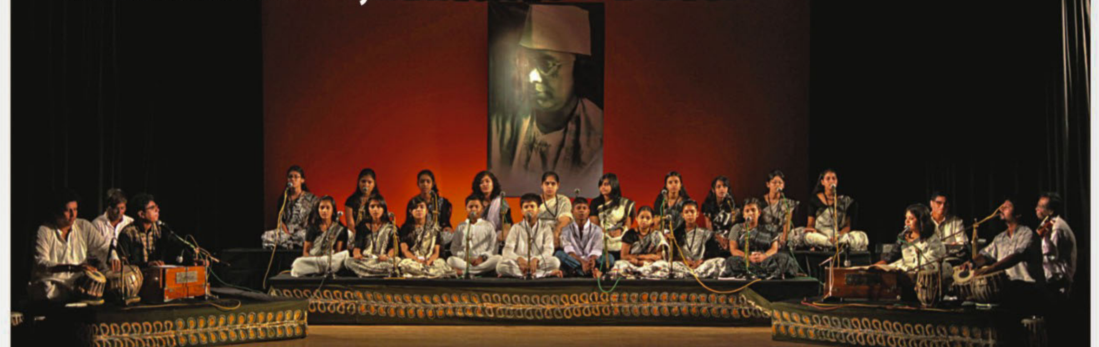
Artistes present a choral rendition.

STAFF CORRESPONDENT Teachers and students of Chhayanaut performed Nazrul's classic compositions (Bhokti O Biroho) on the occasion of the National Poet's 35th death anniversary at Chhayanaut Sanskriti Bhavan Auditorium on September 16.