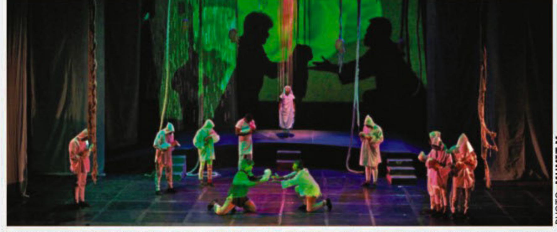
The chronology of genocide in Bangladesh, Uganda, Rwanda, Kosovo, Palestine, Iraq and Afghanistan has been narrated in the play.

Dhaka Theatre staged the 50th show of one of its acclaimed productions "Nimojjon" on September 16 at the National Theatre Hall, Bangladesh Shilpakala Academy.