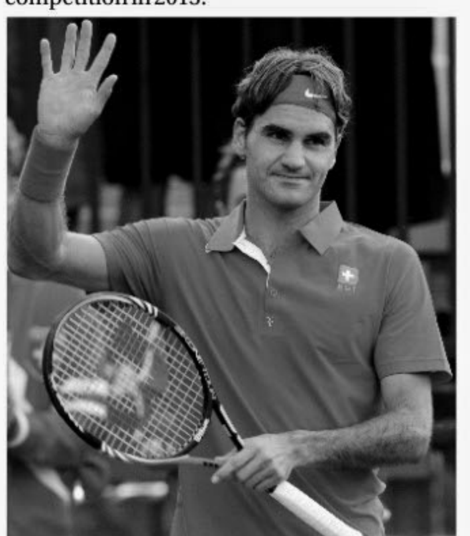
Swiss tennis legend Roger Federer celebrates after defeating Lleyton Hewitt of Australia in the second match of the Davis Cup world group play-off in Sydney on Thursday.

But the world number three dug deep to break back and win the set on a tiebreak before pulling away to win 5-7, 7-6 (7/5), 6-2, 6-3. Hewitt struggled to hold serve throughout the opener and never looked like breaking Federer until he seized his chance at 5-5, pouncing on loose play from the Swiss legend to take the advantage.