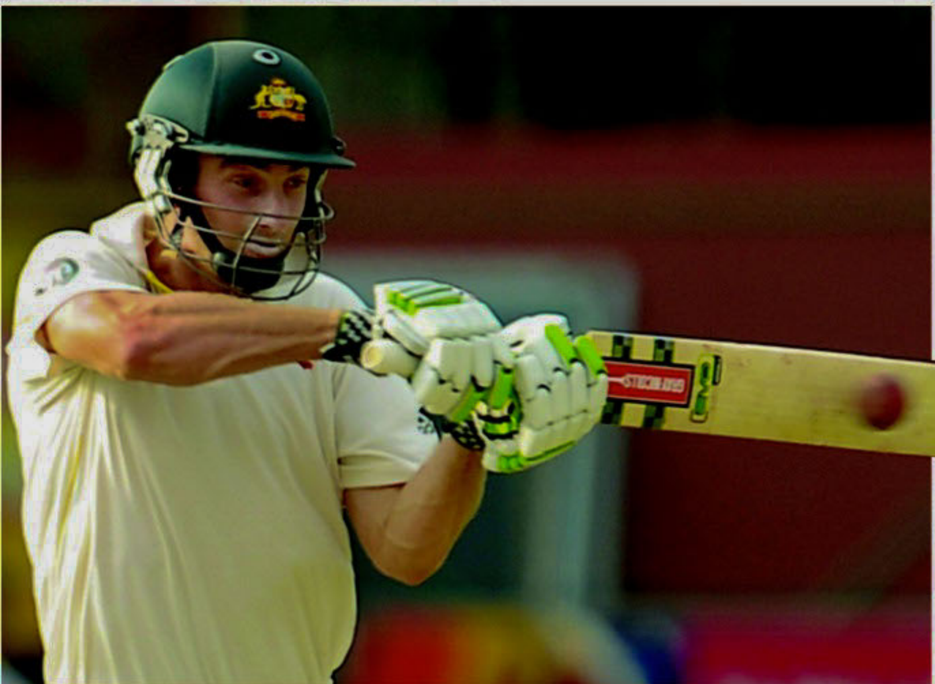
Australia's Shaun Marsh cuts during the first day of the third and final Test against Sri Lanka at The Sinhalese Sports Club Ground in Colombo yesterday.

"I enjoyed the captaincy, I loved it, but it can get tough after a while and some of the enjoyment can go away. So I thought it was the right time to step aside," never the one to complain, Dravid had said after tendering his resignation.