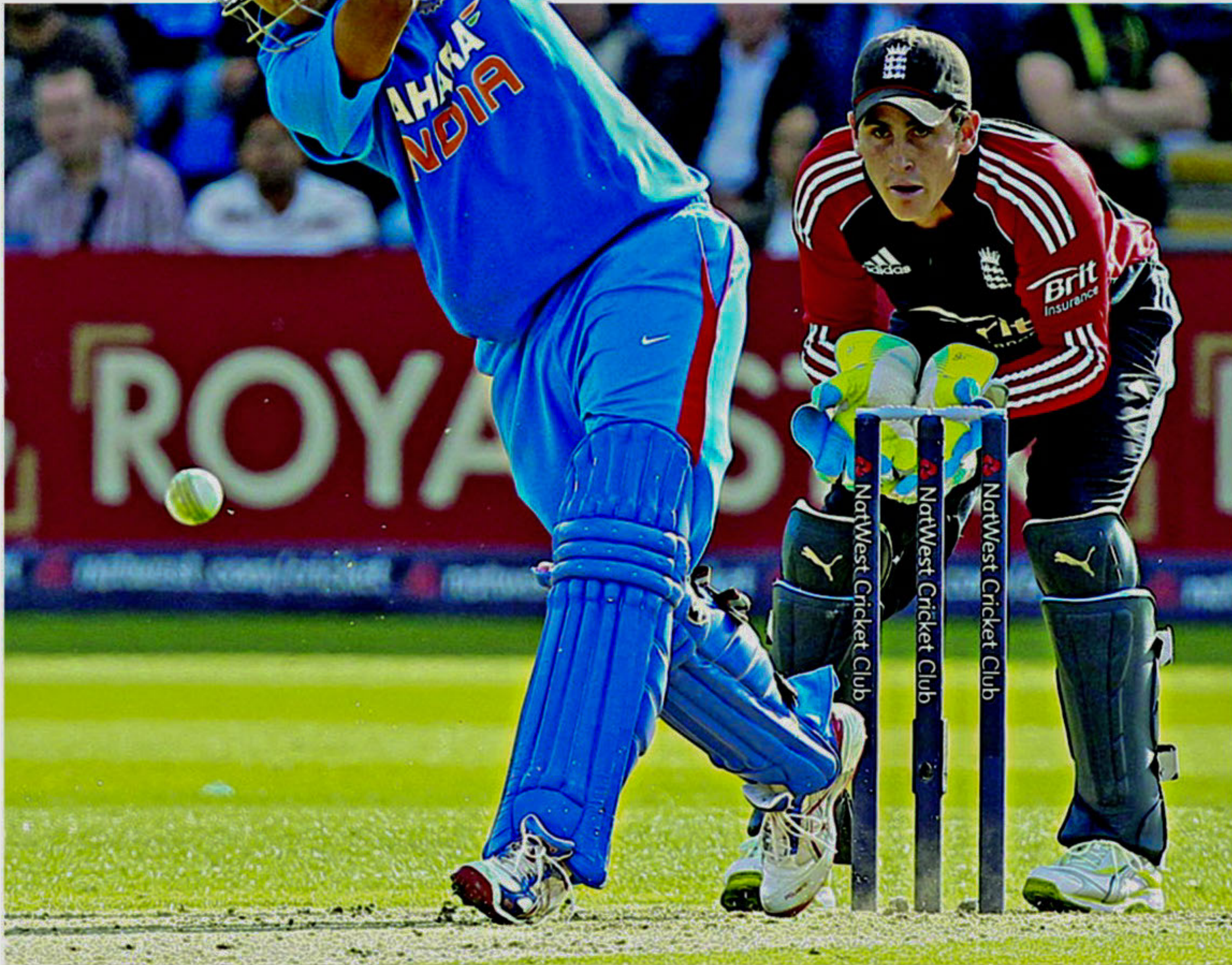
THE END OF AN ERA: Indian batting superstar Rahul Dravid drives down the ground on his way to scoring 69 during the fifth ODI against England in Cardiff yesterday. India finished on 304-6 in Dravid's final appearance in ODIs.