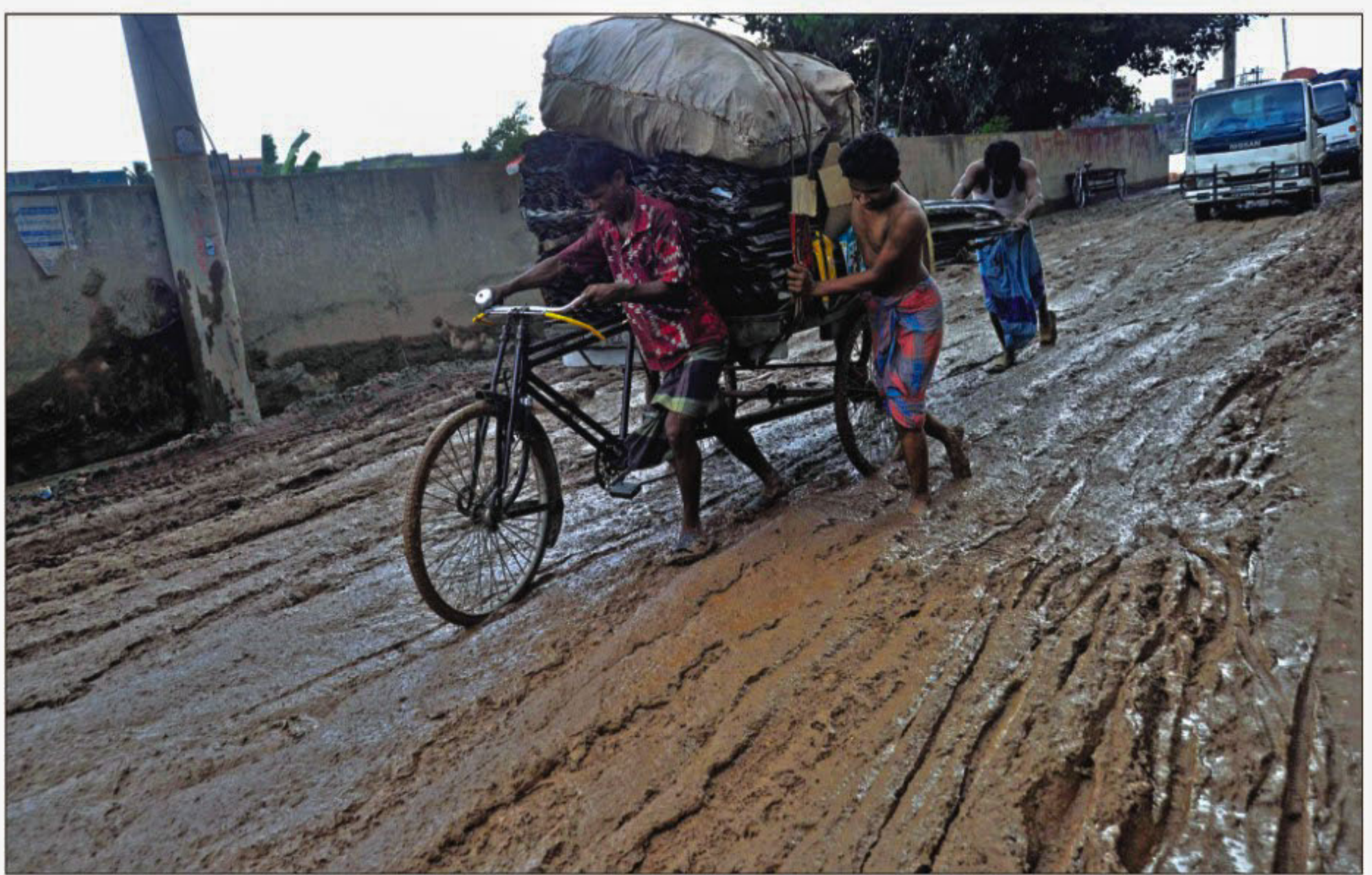
This half-a-kilometre stretch of Beribadh, a road near Islambagh in the capital, has been in this sorry state for the entire monsoon season. The photo was taken yesterday.

PM says no driving licence beyond rules; not happy with battered highways Her directives come in the wake of the Canadian authorities investigating Canada-based engineering firm SNC-Lavalin for corruption in its bid for consultancy work at the $2.9 billion Padma Bridge project. Speaking at a secretary-committee meeting at Bangladesh secretariat, she also asked all to let the government know if there are any other allegations about the project. SEE PAGE 7 COL 1