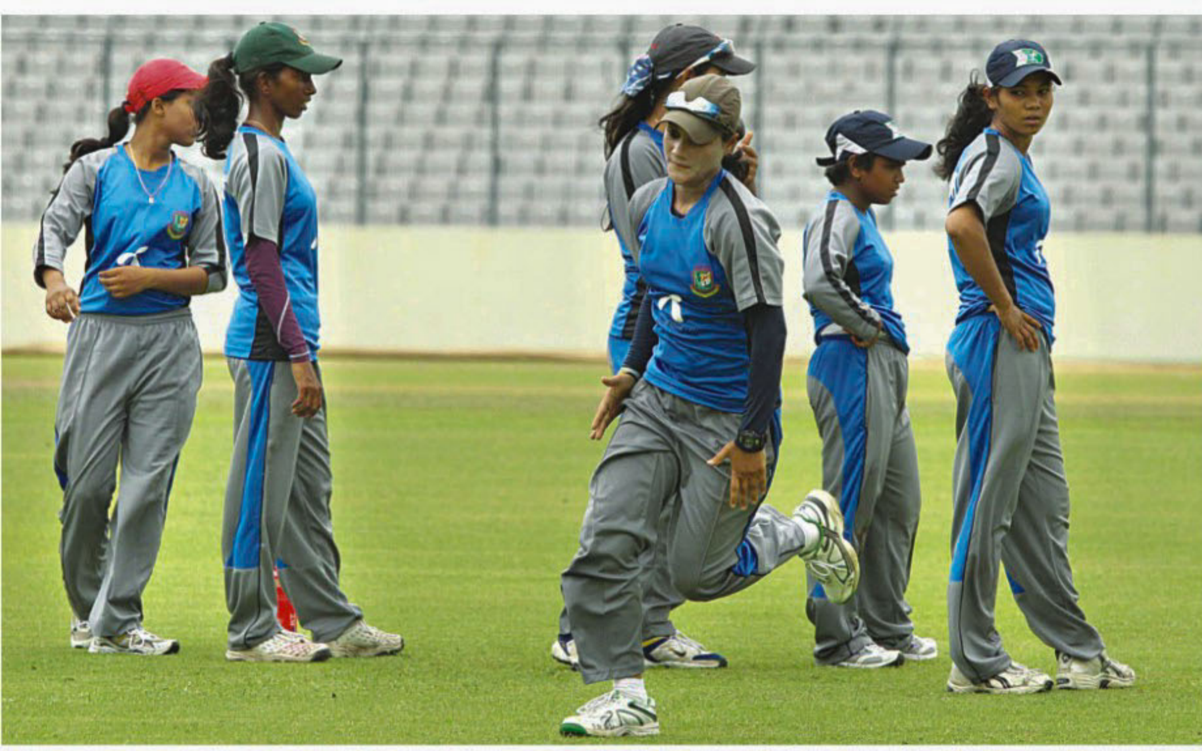
Bangladesh women cricketers practise at the Sher-e-Bangla National Stadium in preparation for the Women's World Cup qualifiers in November.