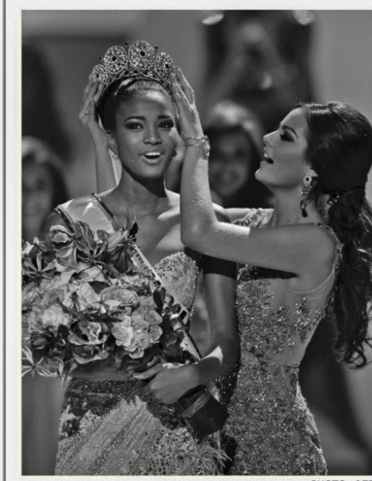
Miss Angola 2011 Leila Lopes is crowned Miss Universe 2011 by Miss Universe 2010 Ximena Navarrete of Mexico at the 60th annual Miss Universe beauty pageant at the Credicard Hall in Sao Paulo.