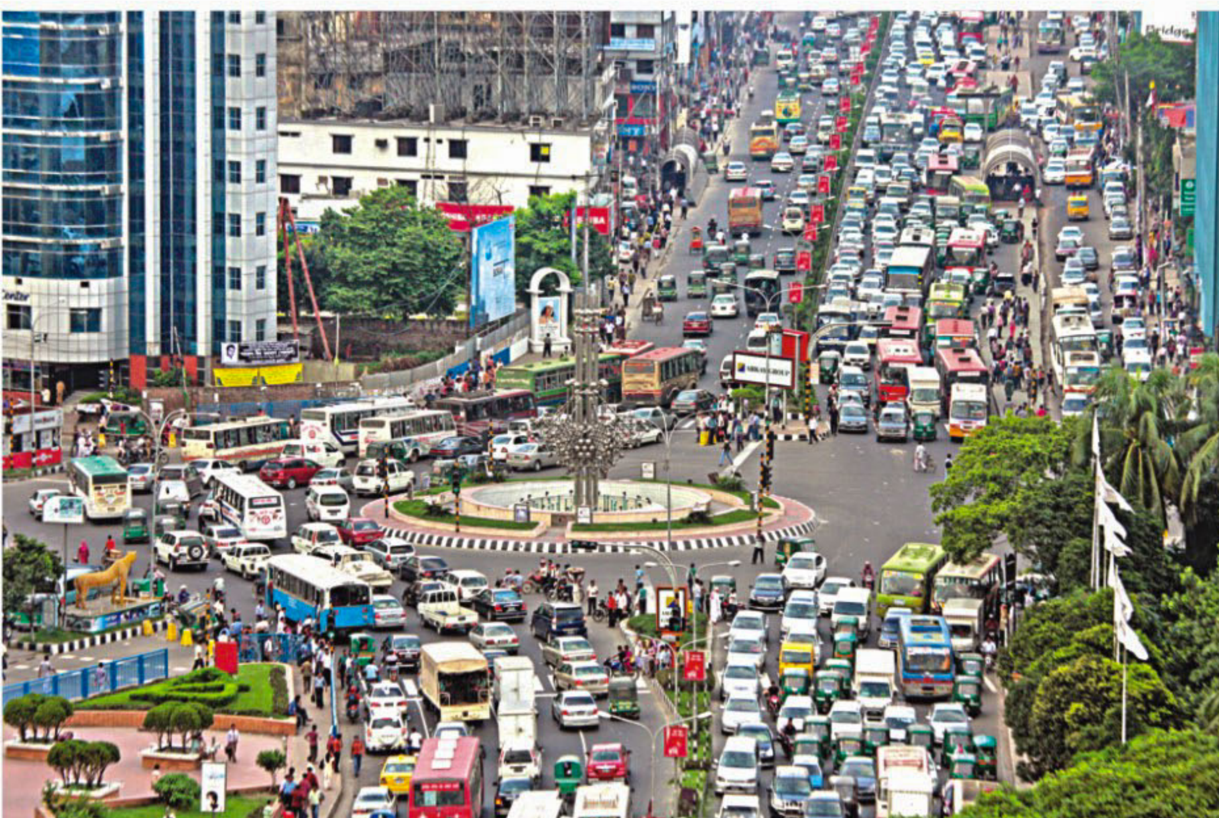
The traffic at Hotel Sonargaon intersection in the capital yesterday afternoon. The city life is back in full swing with its usual congestion that was lighter early this month following the Eid festivity.