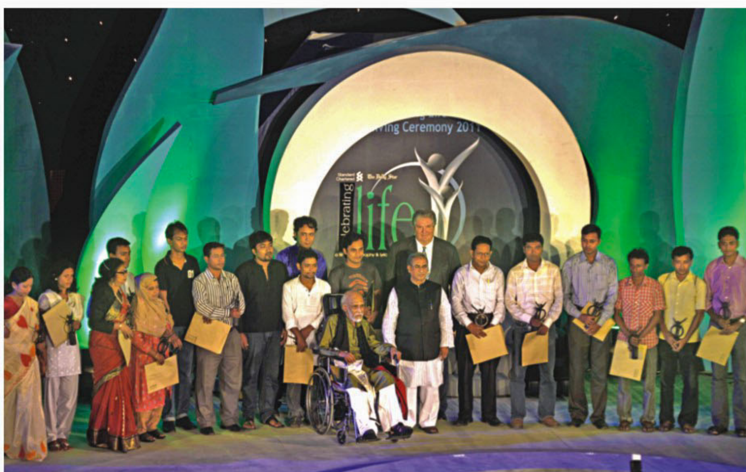
Winners in different categories of Celebrating Life 2011 competition pose with Khandaker Nurul Alam, a legendary composer of Bangladeshi film; Abul Kalam Azad, cultural affairs minister; and Jim McCabe, chief executive officer of Standard Chartered Bank, Bangladesh, at Bangabandhu International Conference Centre in the capital yesterday.