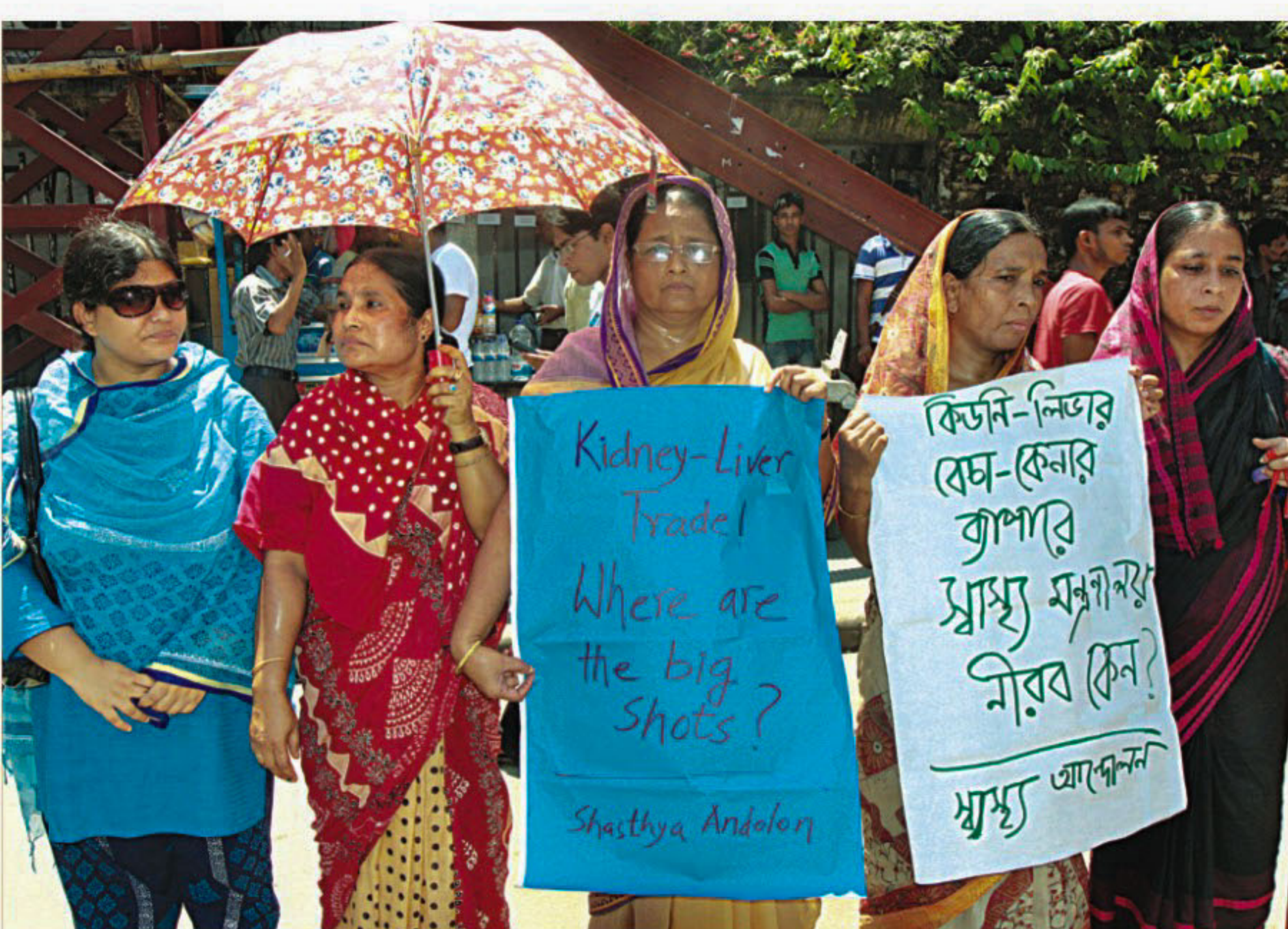
Swasthya Andolan forms a human chain in front of Jatiya Press Club in the city yesterday demanding arrest and trial of those involved in the country's illicit kidney trade.