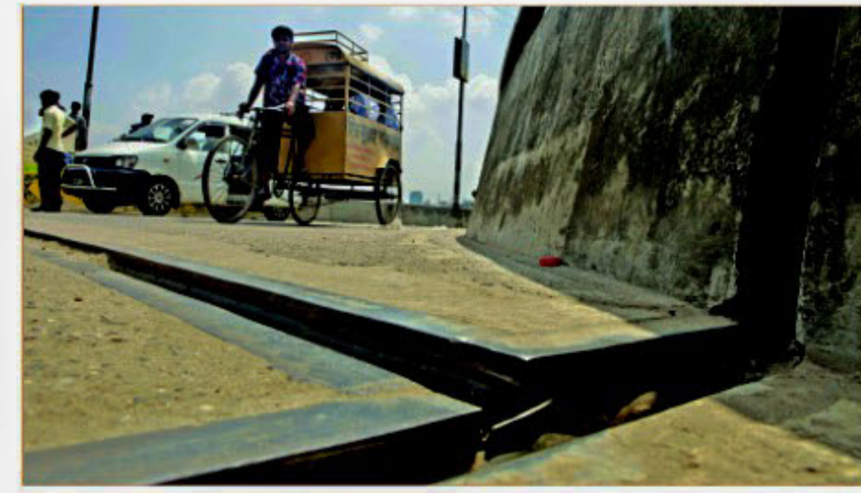
Plants grow from one of the pillars of Khilgaon flyover in the capital, a sign that the structure is not being maintained properly. Around 1:00pm yesterday vehicles started using the flyover again after the authorities announced the sinking of a segment of it, bottom right, was nothing to be worried about.