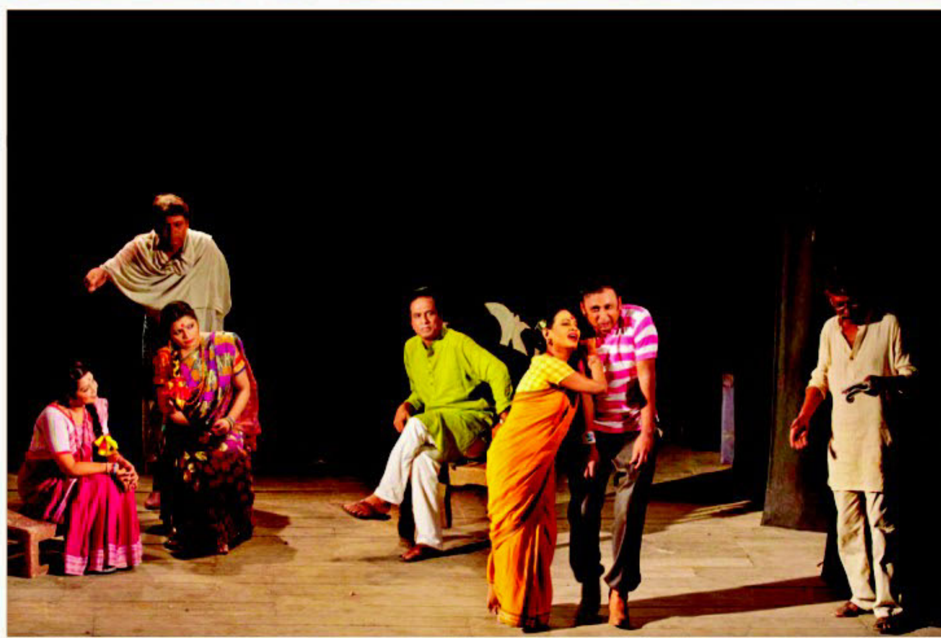
The five-day festival featured scenes from 48 popular plays.