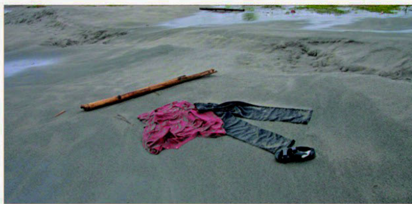
Clothes and a sandal of the students bludgeoned to death by a mob of several hundred villagers at Keblarchar in Aminbazar on the outskirts of the capital early July 18.