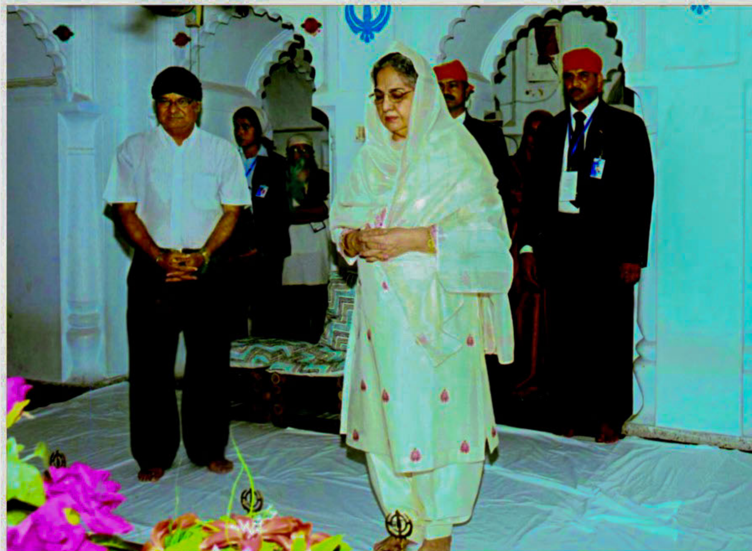
Gursharan Kaur, wife of Indian Prime Minister Manmohan Singh, visits Gurdwara Nanak Shahi, a Sikh temple, on Dhaka University campus yesterday.

Police said an unnatural death case was filed with Sabujbagh Police Station in this connection.