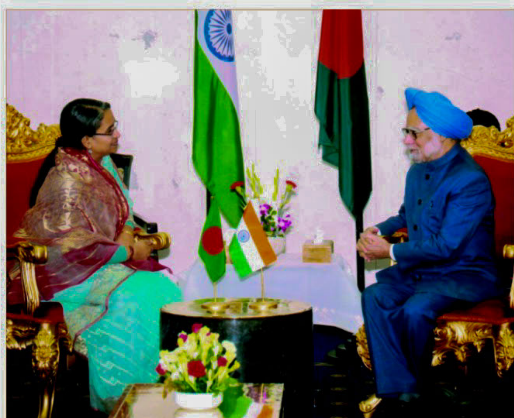
Foreign Minister Dipu Moni speaks to Indian Prime Minister Manmohan Singh at Sonargaon Hotel in the city yesterday.

"Today's realities, more than ever before, have taught us the value of interdependence of cooperation. For neighbours, border cannot have walls, but windows for collaboration and exchange. This is why relations with our neighbours require special focus. That is why the need for connectivity," she said.