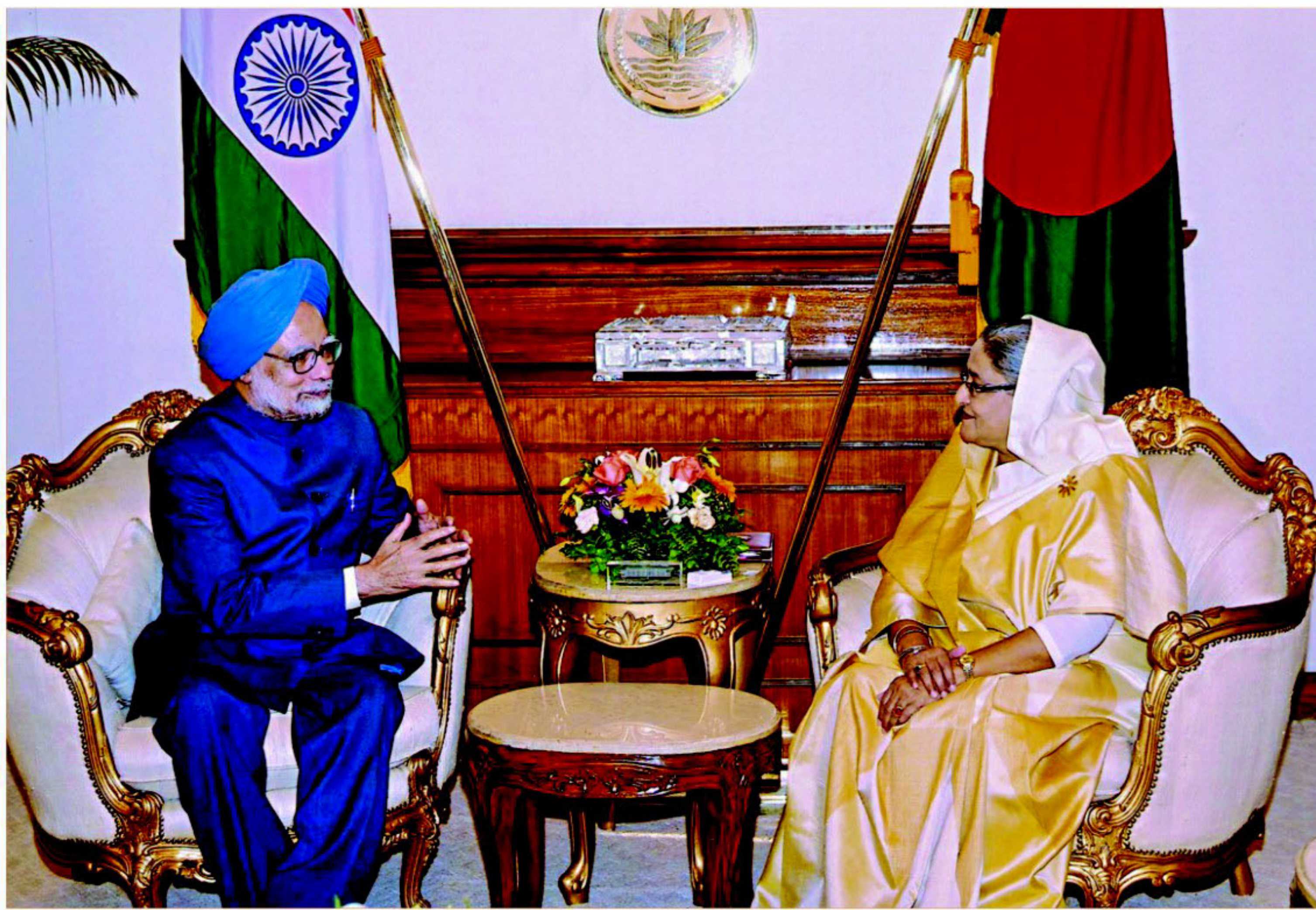
Prime Minister Sheikh Hasina having a tête-à-tête with her India counterpart Manmohan Singh at her office in the city yesterday. (Story on Page 1)

Mizoram Chief Minister PU Lalthanhawla, Tripura Chief Minister Manik Sarkar, Meghalaya Chief Minister Mukul Sangma and Assam Chief Minister Tarun Gogoi attended the meeting.