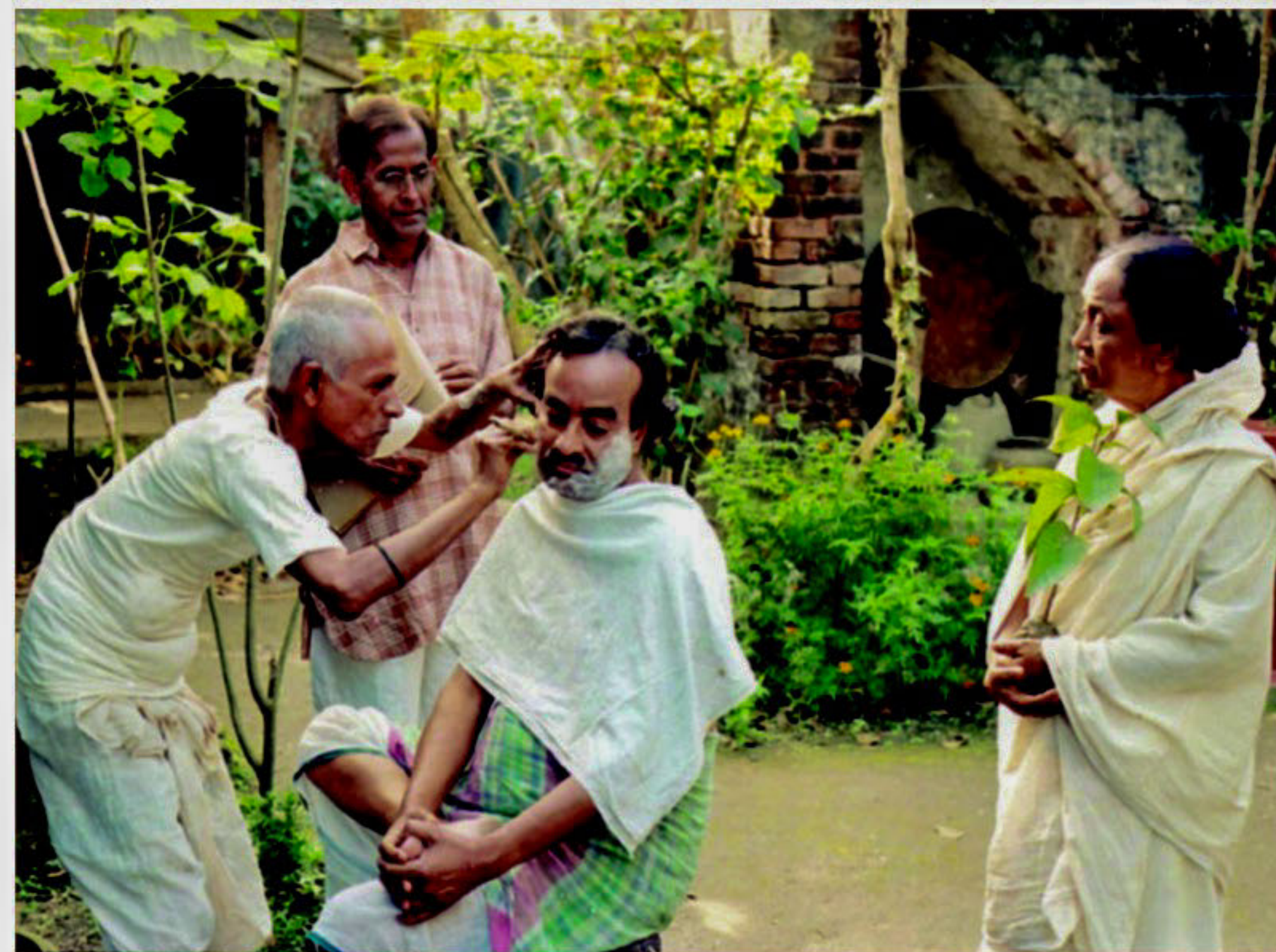
A scene from Chitra Nadir Parey.

During the two-hour event, his films and works were discussed in the presence of a good number of Kolkata's film directors and intellectuals.