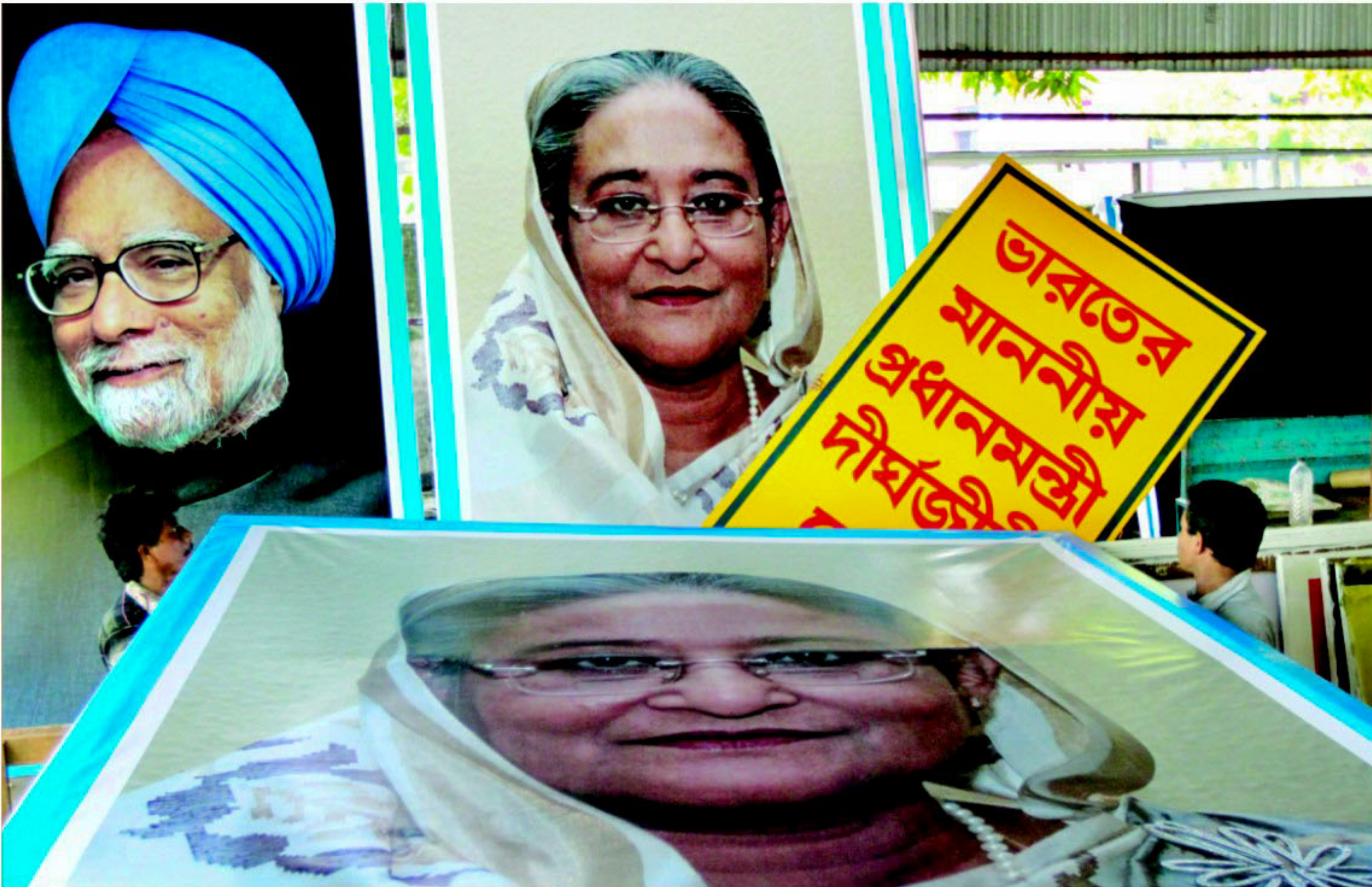
The portraits of Prime Minister Sheikh Hasina and her Indian counterpart Manmohan Singh are ready to be hung up around the city prior to Manmohan's visit here tomorrow. The photo was taken from Public Works Department yesterday.