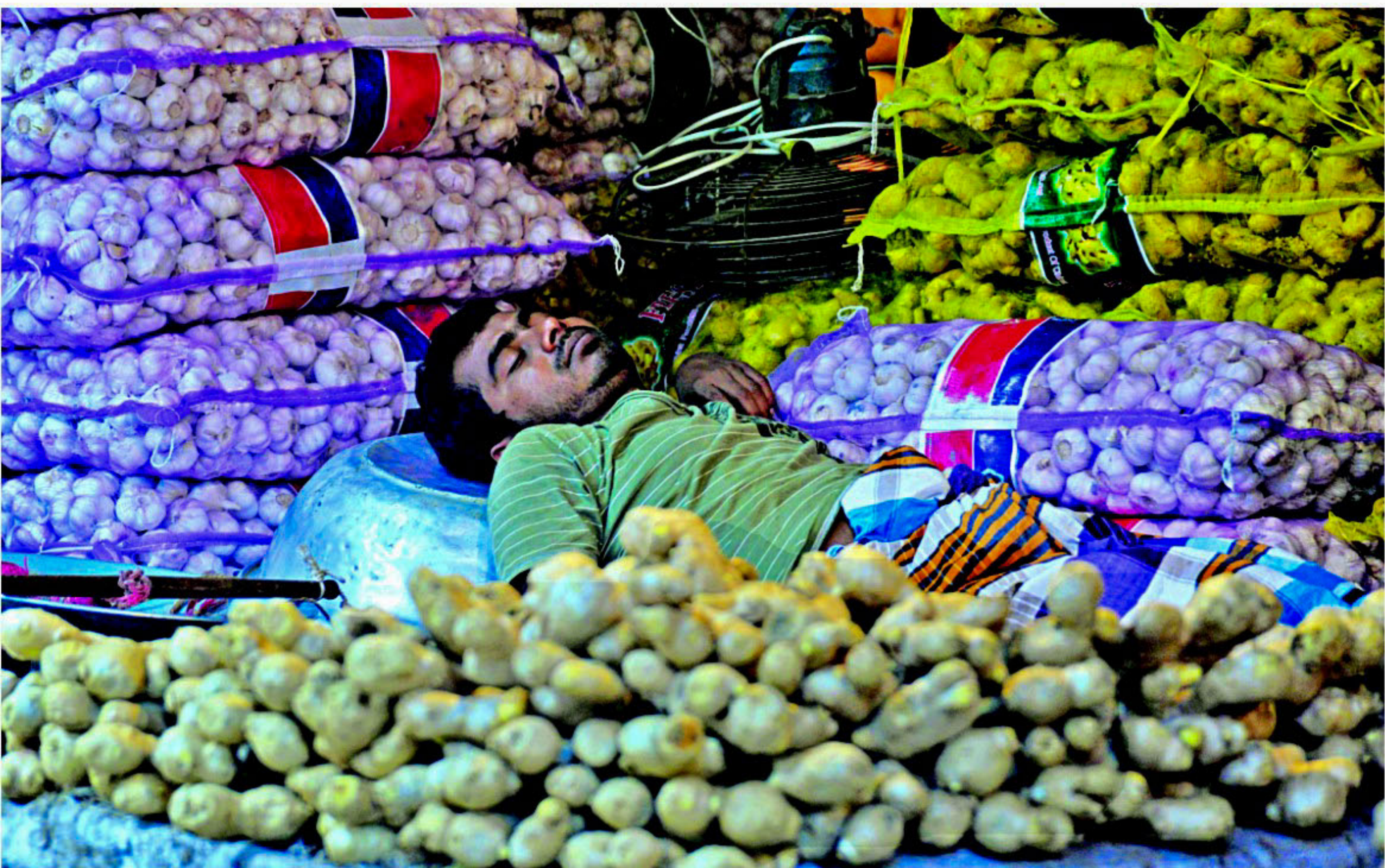
A seller at the city's Karwan Bazar takes a nap as hardly any customers show up yesterday. The market places were yet to get back the crowds as the city was still in the mood of Eid vacation.

The condition of former president Iajuddin Ahmed improved early today, sources at Apollo Hospital said. He was removed from life support as his condition improved, duty manager of the hospital told The Daily Star around 1:45am. The former president SEE PAGE 19 COL 8