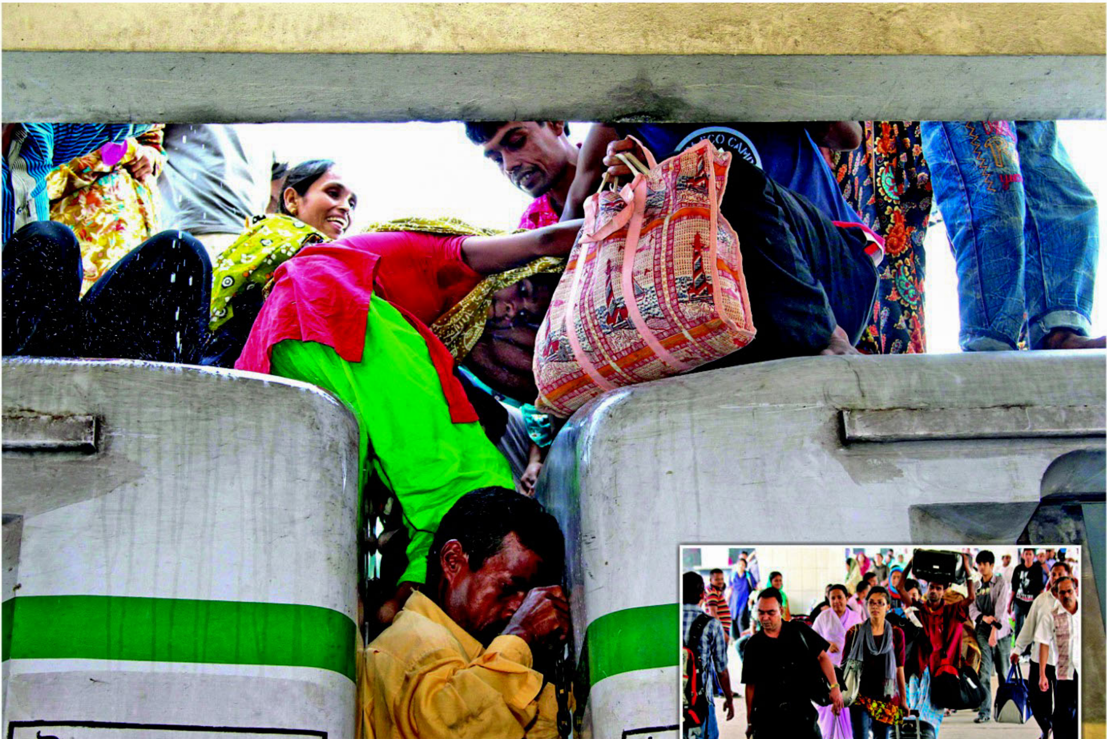
The Eid vacation is over. People have started to get back to the capital. Many of them have to travel on the rooftops of trains, although the act is a punishable offence. The photos were taken at Kamalapur Rail Station yesterday.