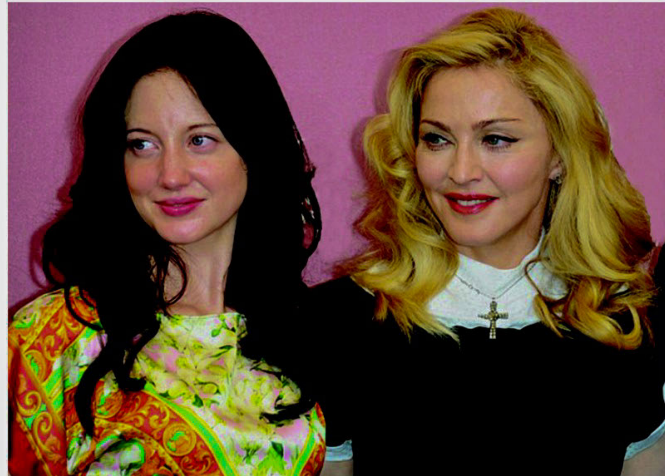
Actress Andrea Riseborough with "W.E." writer and director Madonna.

Well, maybe this won't be the movie to turn around Madonna's faltering movie career.