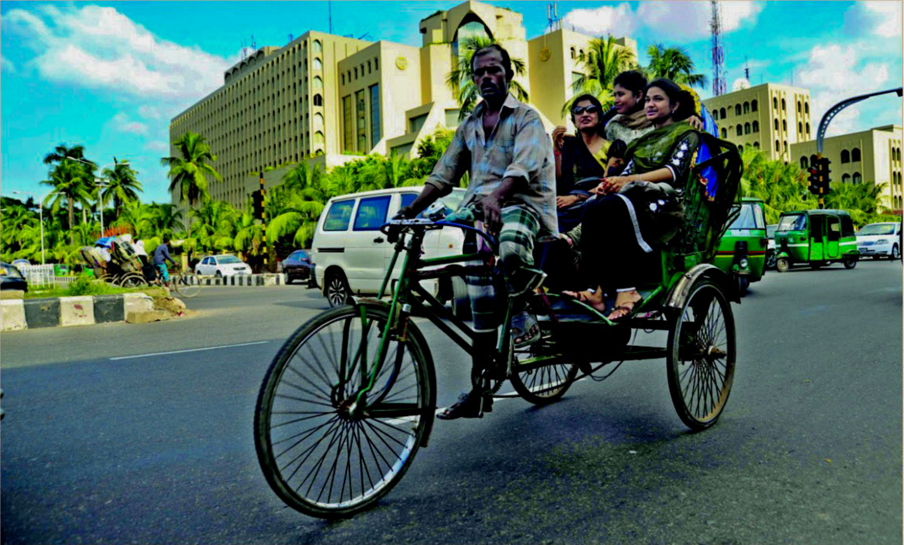
With the streets well clear of vehicles and crowds due to the Eid-ul-Fitr vacation, some city dwellers enjoy a rickshaw ride around Dhaka, even on streets which are off-limits to the vehicle. The photo was taken in front of Ruposhi Bangla Hotel yesterday.