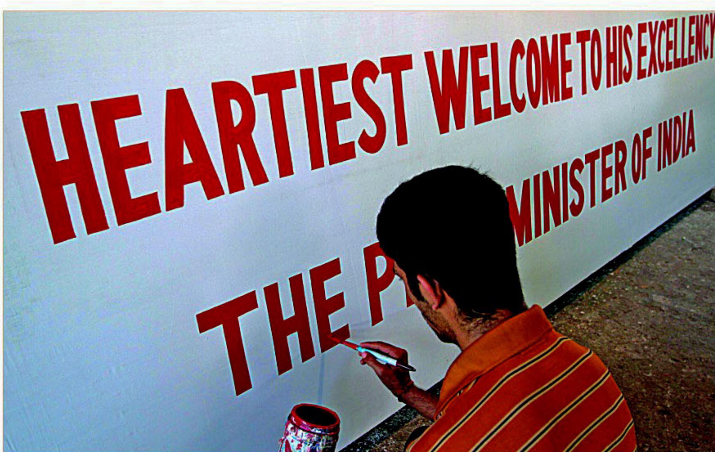
As everything is set for Indian Prime Minister Manmohan Singh's Dhaka visit on September 6, the Public Works Department authorities prepare welcome banner yesterday.