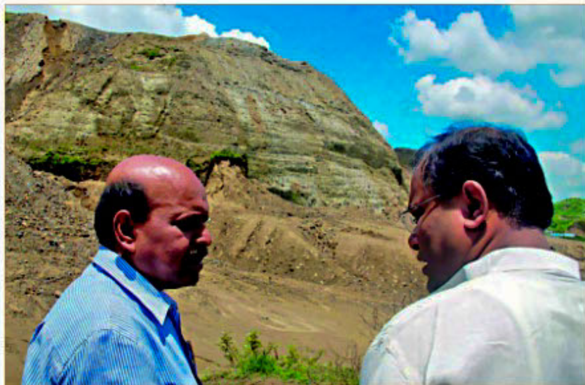
State Minister for Environment and Forest Hasan Mahmud along with a DoE team find freestyle hill-cutting at Pahartali and near Jangal Latifpur in Sitakunda yesterday.