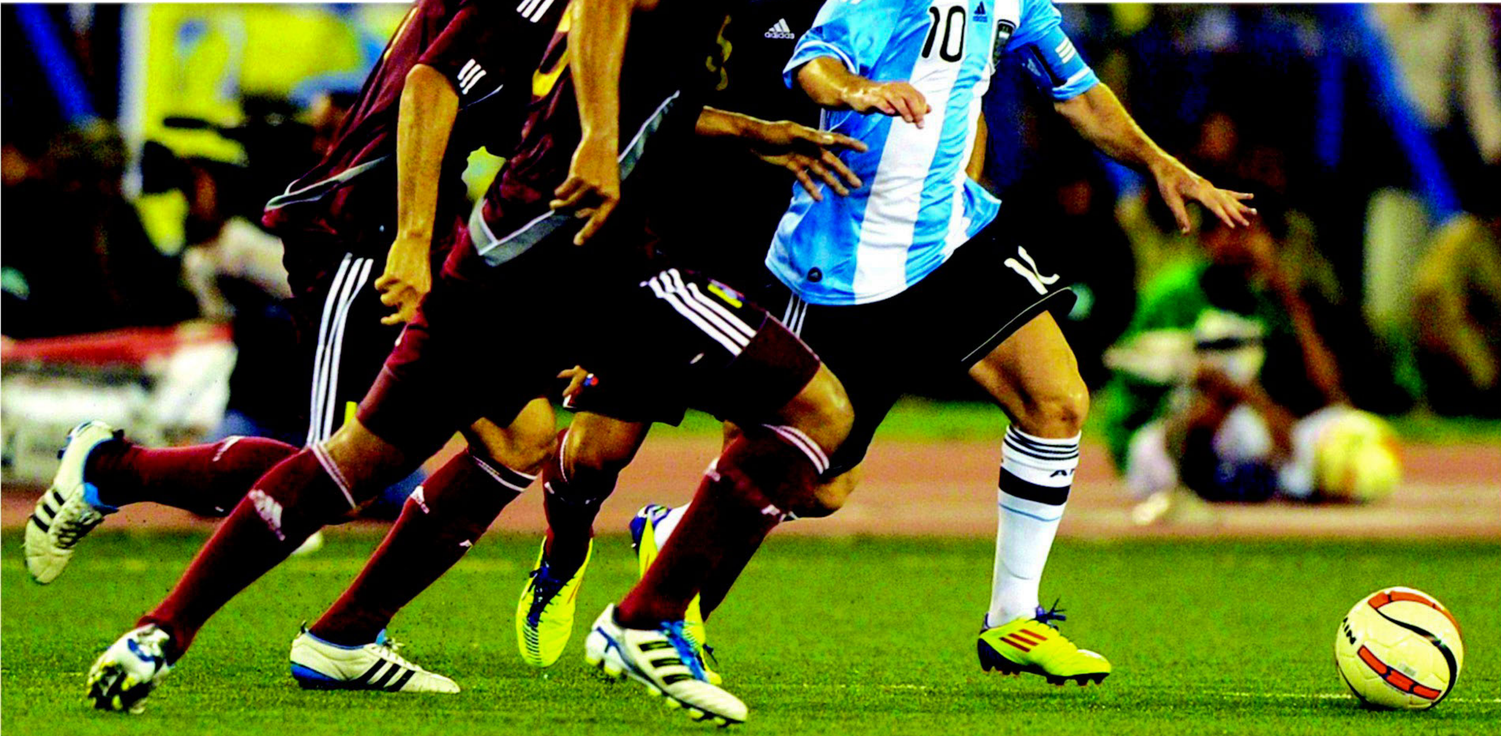
THE STAR OF THE SHOW: Argentina captain Lionel Messi (R) is chased by a host of Venezuela players during their international friendly match in Kolkata yesterday.