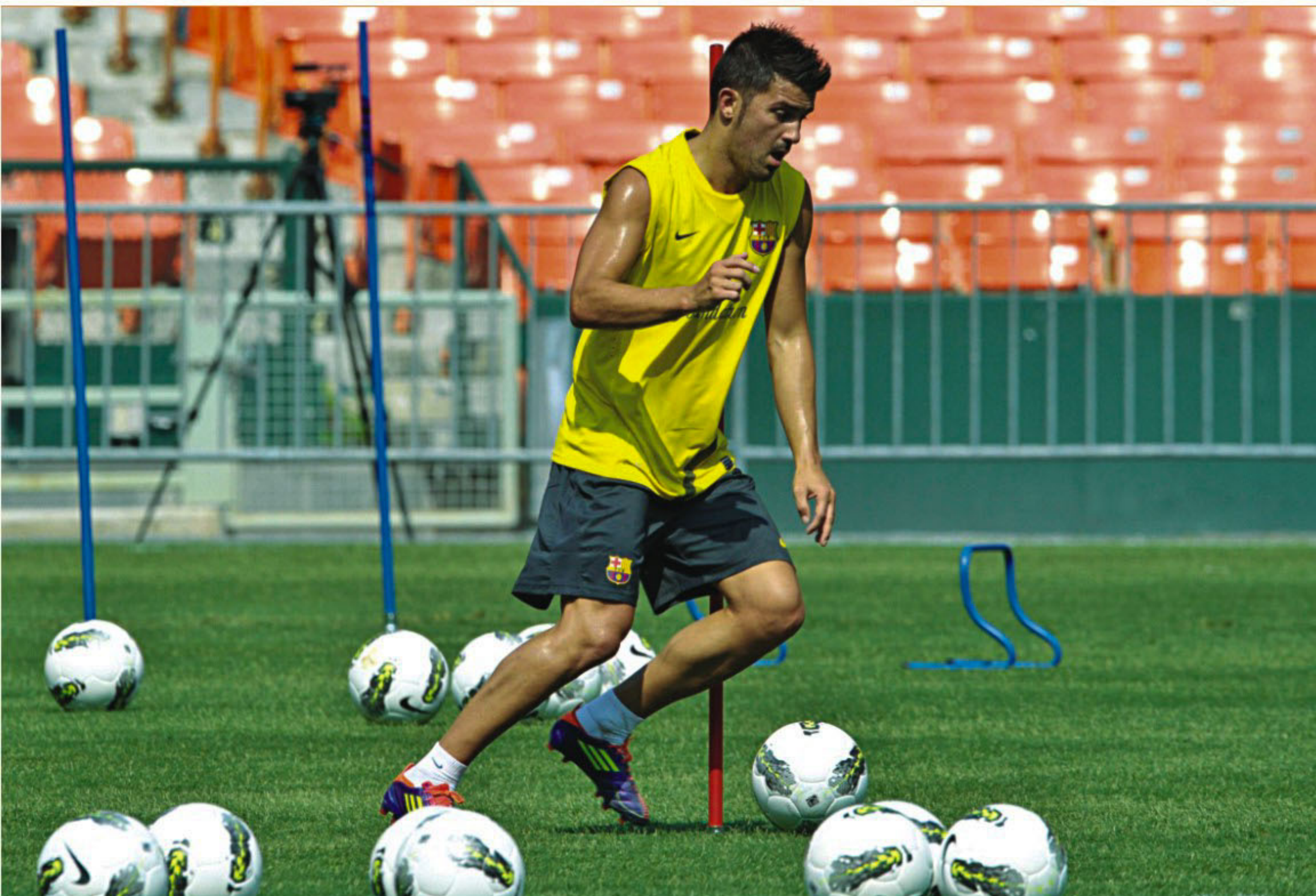
Barcelona striker David Villa dribbles the ball during a training session at the RFK Stadium in Washington DC on Friday.

However, after a six-hour hearing at UEFA headquarters, the fine remains in place, but the suspension has been reduced to three matches, plus two suspended.