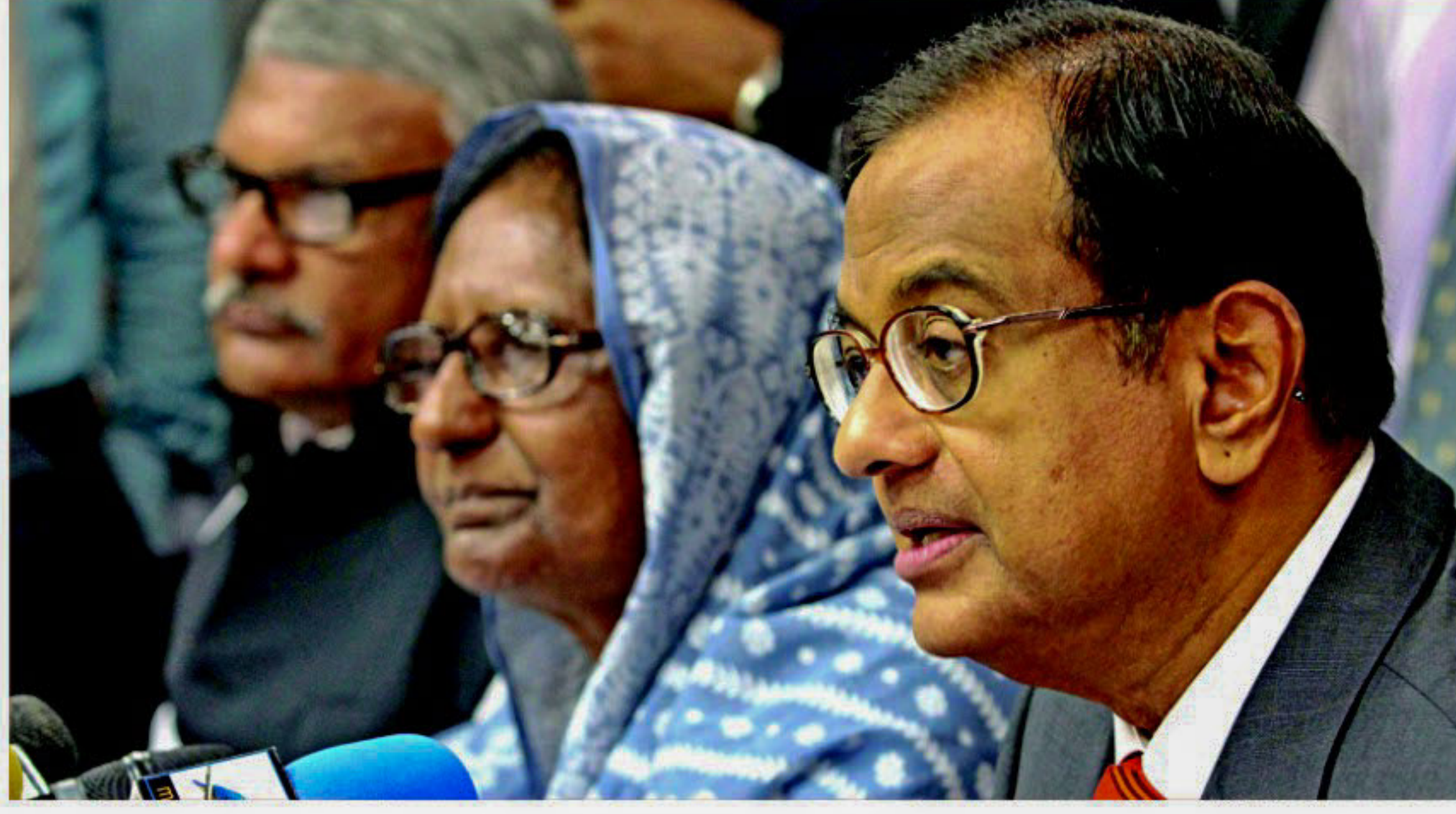
Indian Home Minister Palaniappan Chidambaram speaks to the media at a joint press conference at the home ministry yesterday while Home Minister Shahara Khatun looks on.

The Indian minister who arrived in Dhaka on Friday night for a one-day visit also claimed that the number of people getting killed at the borders has come down to seven this year, which