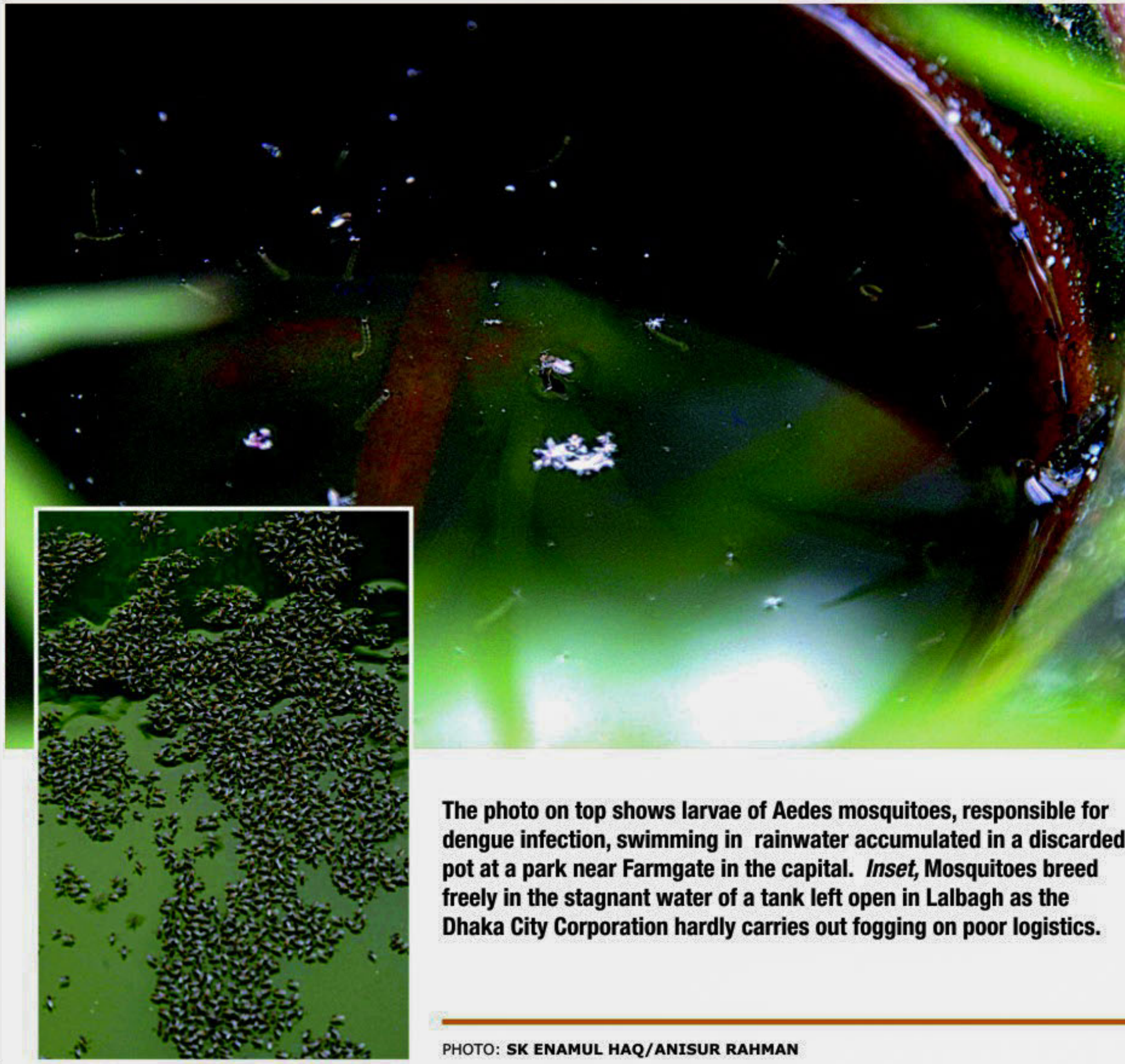
The photo on top shows larvae of Aedes mosquitoes, responsible for dengue infection, swimming in rainwater accumulated in a discarded pot at a park near Farmgate in the capital. Inset, Mosquitoes breed freely in the stagnant water of a tank left open in Lalbagh as the Dhaka City Corporation hardly carries out fogging on poor logistics.