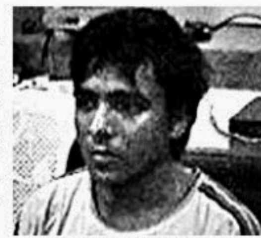
Ajmal Amir Kasab

The lone surviving gunman from the 2008 Mumbai attacks that left 166 dead has filed a case at the Indian Supreme Court asking for his death sentence to be overturned, a court source told AFP yesterday.