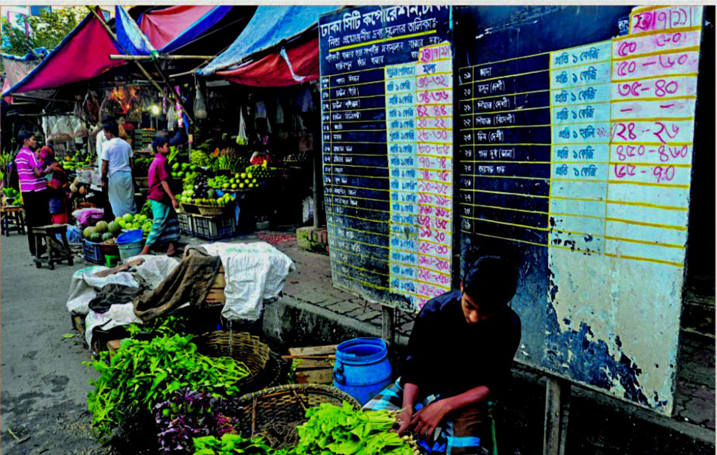
The Dhaka City Corporation signboard at Hatirpul Bazar shows prices of essentials. The DCC is supposed to update the board but it is the market authorities who are doing the job every day. Even then, there is a wide disparity between what the chart says and what the price actually is in the market. The photo was taken yesterday.