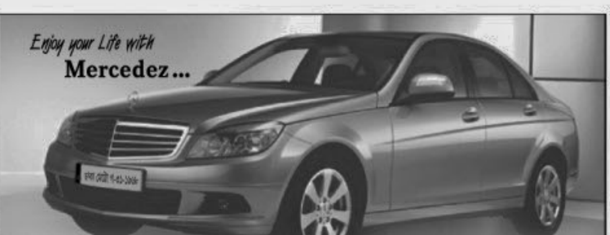
Mercedes C 2007-Reg. 2011 Show Room Condition Lowest Price-70.0 Lac