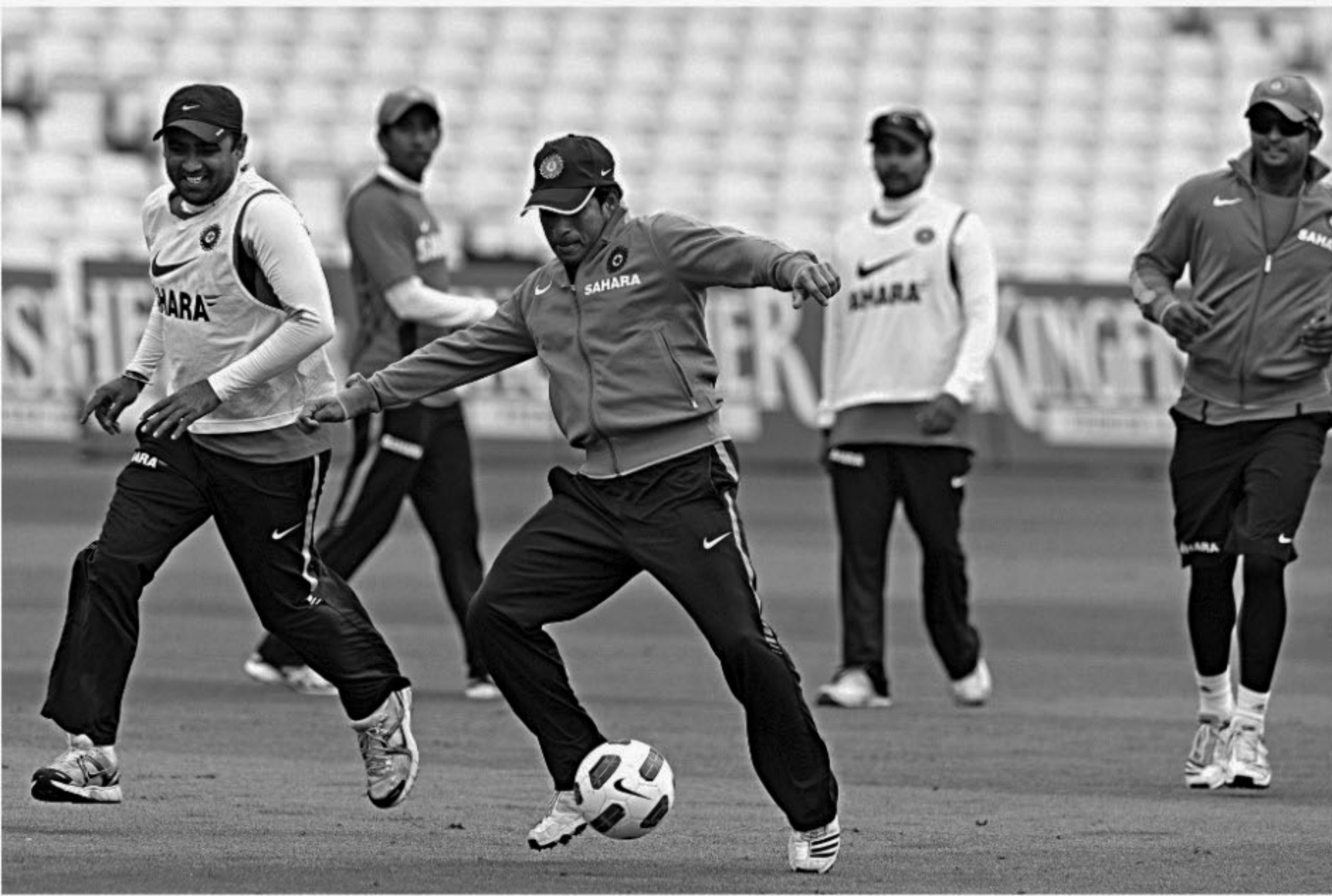
India batsman Sachin Tendulkar displays a different type of footwork before a practice session at Trent Bridge in Nottingham yesterday, ahead of the second Test against England starting tomorrow.