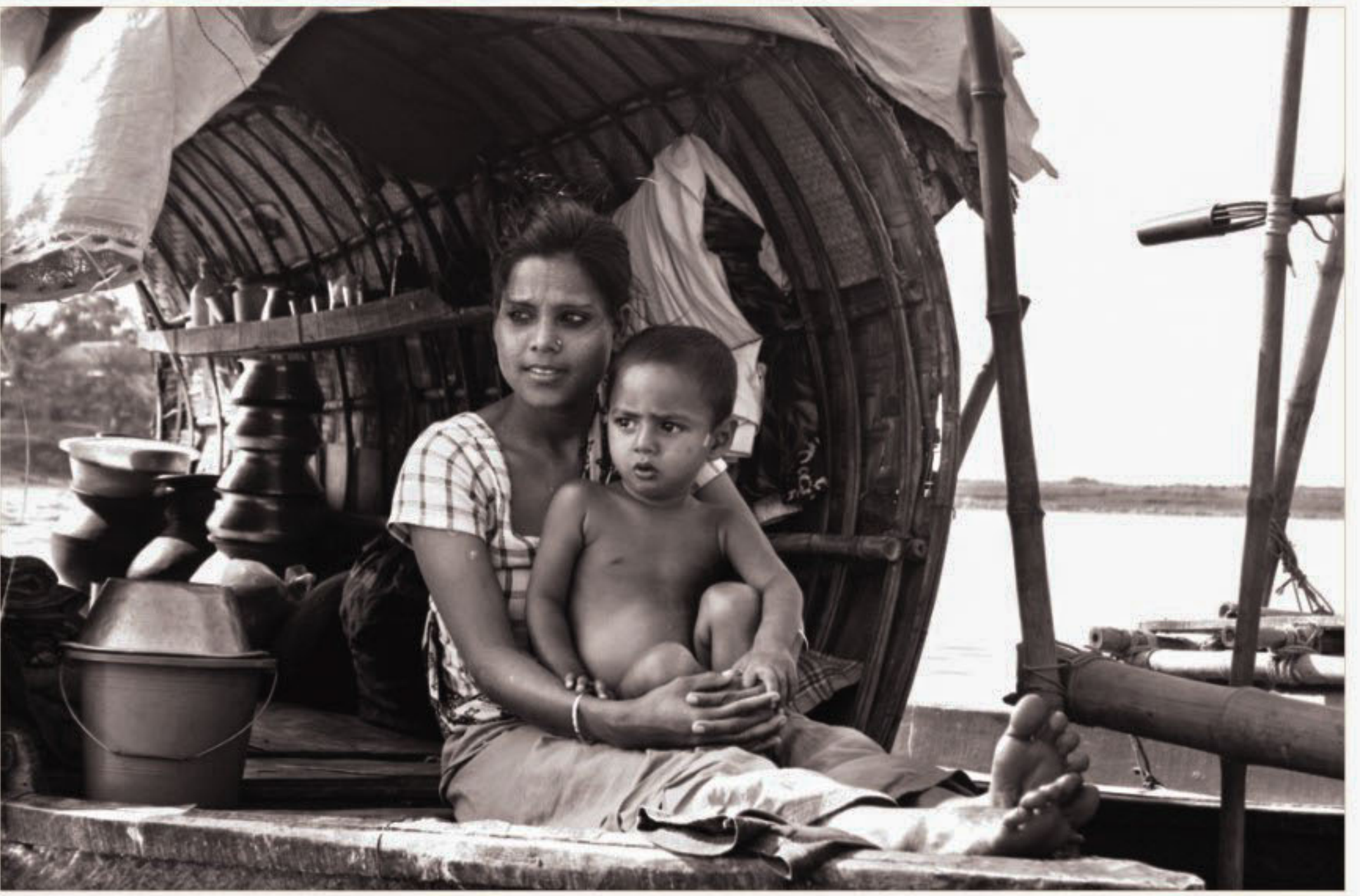
depict the captive urban lifestyle in a symbolic way-- four engaged parrots and an urban apartment in the backdrop. Kuhu's photo "Nari" articulates a joyous moment of a young girl standing at a balcony. The exhibition ends today (July 28).

Badhon's photo is a portrayal of a mother and her child from a bedey (gypsy) community. Taken in black and white medium, Badhon titled his photo as "Nodimatrik". Kundu's photo "Urban Life", seeks to