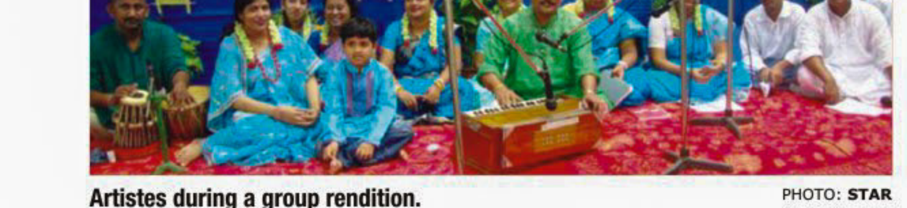
Artists during a group rendition.