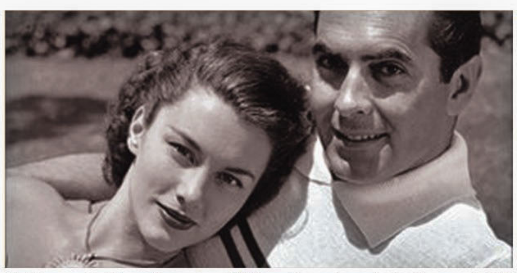
Christian married Tyrone Power, one of Hollywood's most popular leading men, in 1949.

Born Blanca Rosa Welter in Mexico, Christian was discovered by Errol Flynn in Acapulco before pursuing an