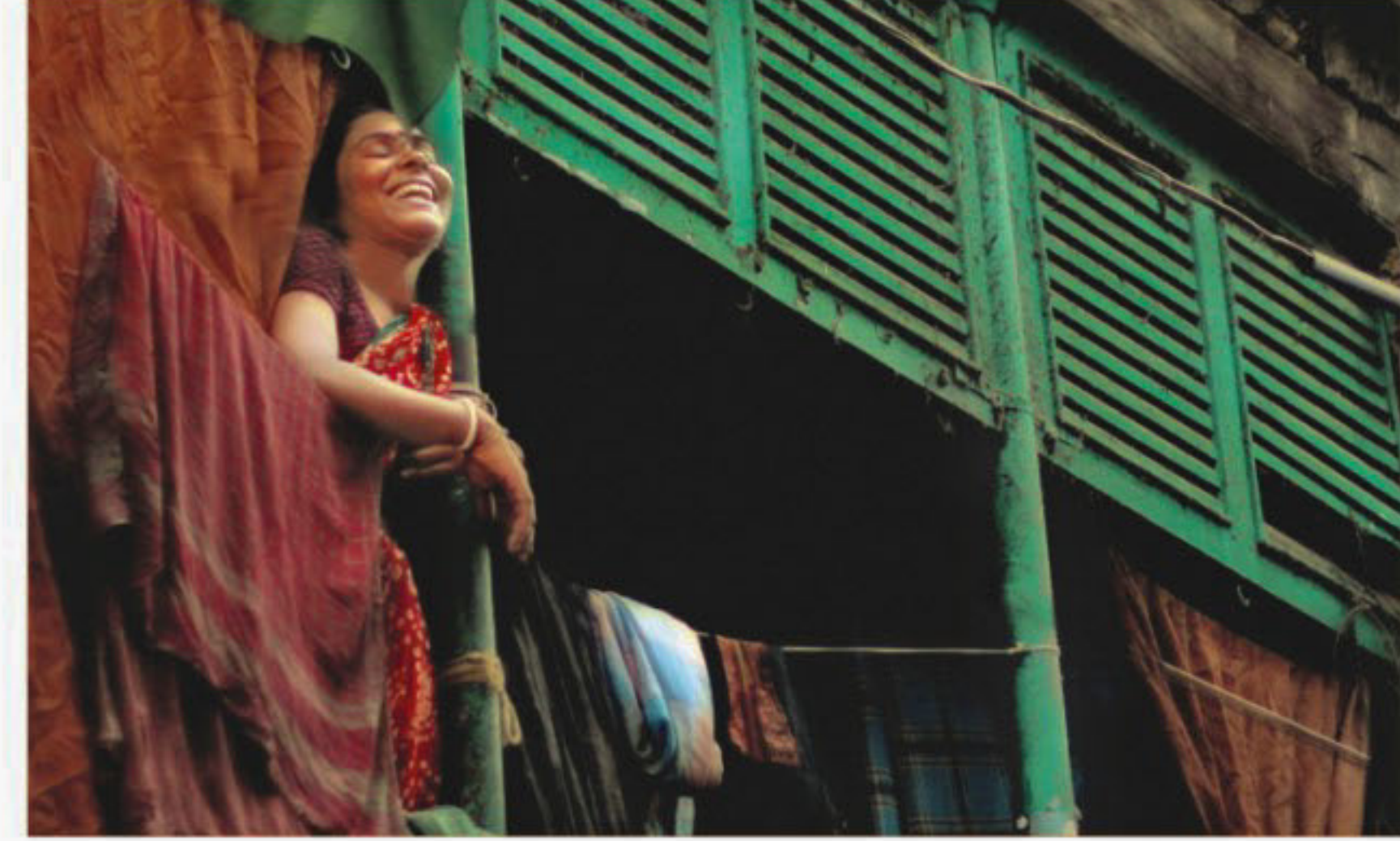
The photographs showcase moments from life to the scenic beauty of the country.