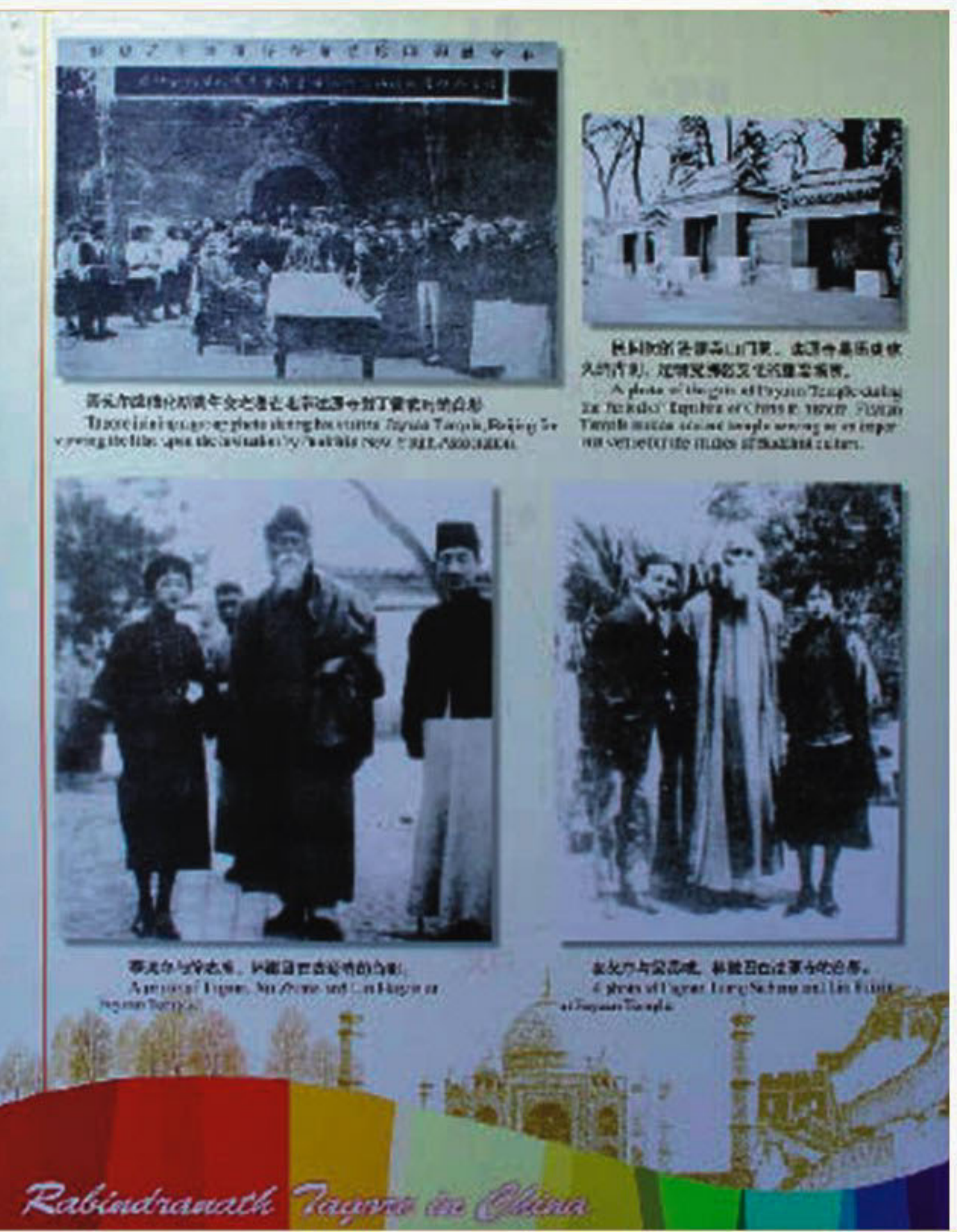
Photographs of Tagore in China.

Chinese literary circles were completely swayed by Tagore's visit to their country. Many publications like The Orient Magazine, Novel Monthly and Buddhist New Youth had special issues on Tagore. The Chinese media also dedicated a large body of reports and coverage of the event. In fact so great was Tagore's appeal in China that over a passage of time most of his works have been translated and published in Chinese.