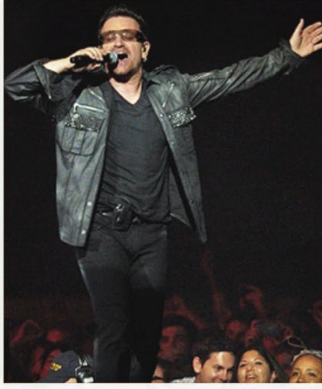
Bono of U2 performs at the New Meadowlands Stadium in East Rutherford, New Jersey.