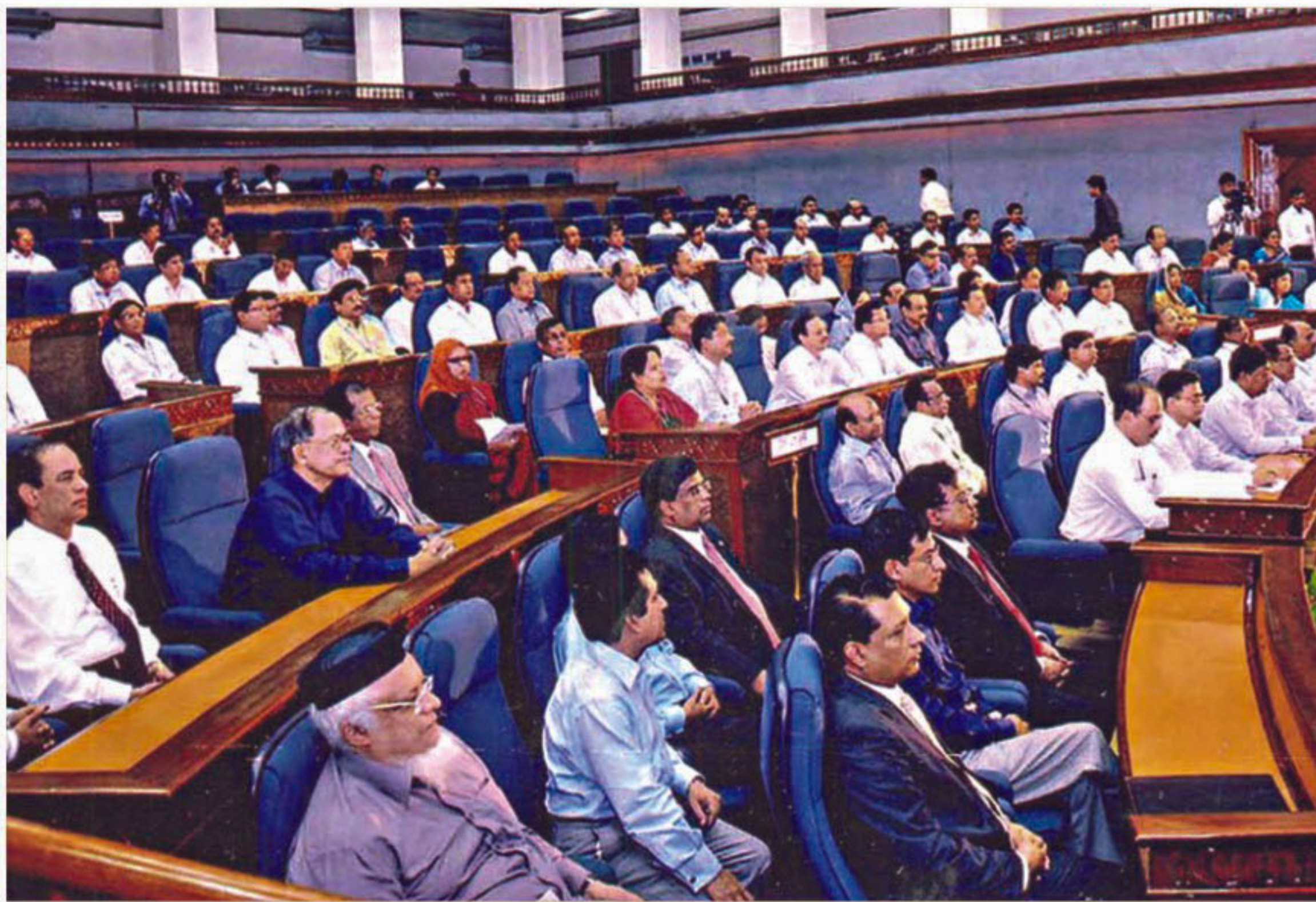
Prime Minister Sheikh Hasina speaks at the inaugural function of the divisional commissioners' conference at her office in the city yesterday. (Story on Page 1)