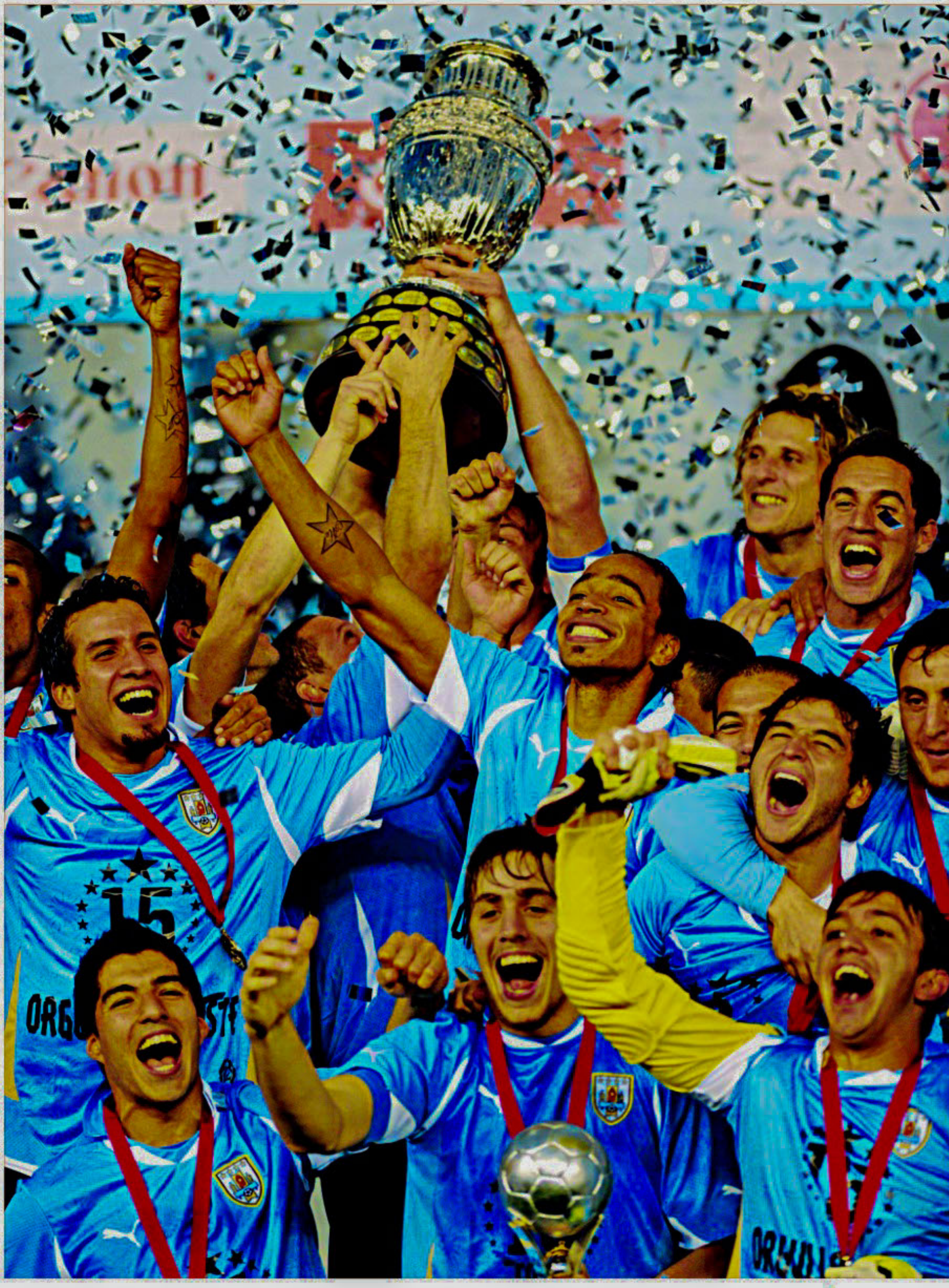
Uruguayan players celebrate with the trophy at the end of the Copa America final against Paraguay at the Monumental Stadium on Sunday.

Forlan then hit his 31st international goal in the last minute after being set-up by Cavani and Suarez.