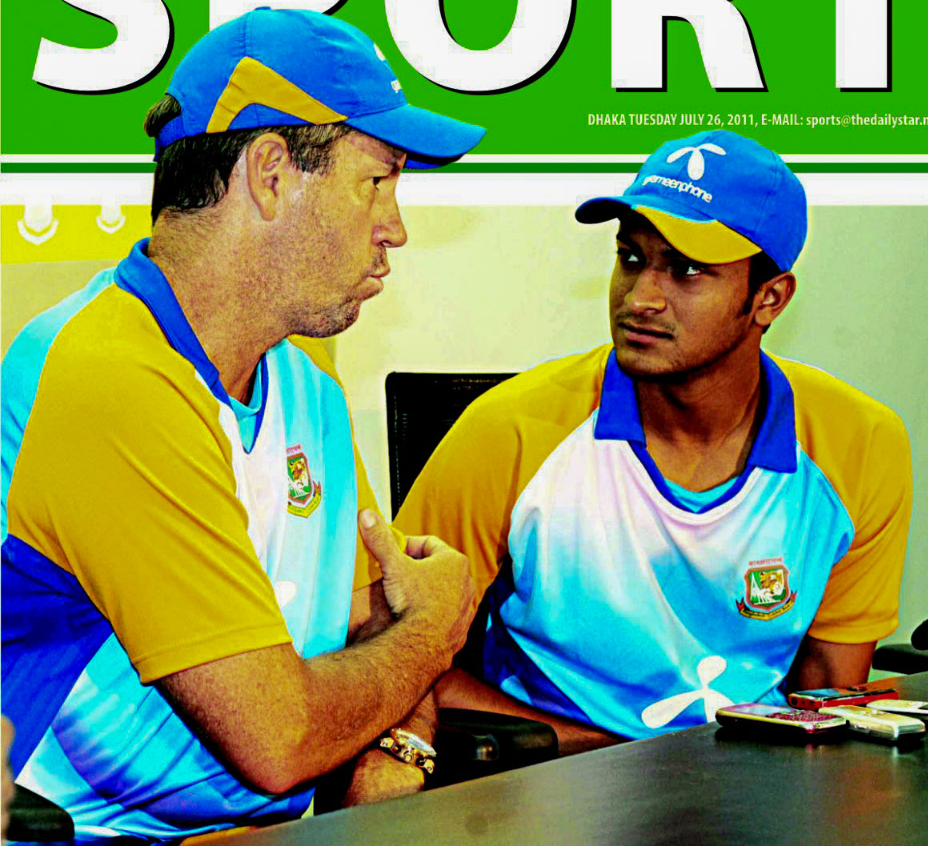
Bangladesh's cricket team's captain Shakib Al Hasan (R) listens intently to what the coach Stuart Law has to say during their official press conference at the Sher-e-Bangla National Stadium yesterday. The team will be leaving tomorrow for Zimbabwe where they will play one Test and five one-day internationals against the hosts.