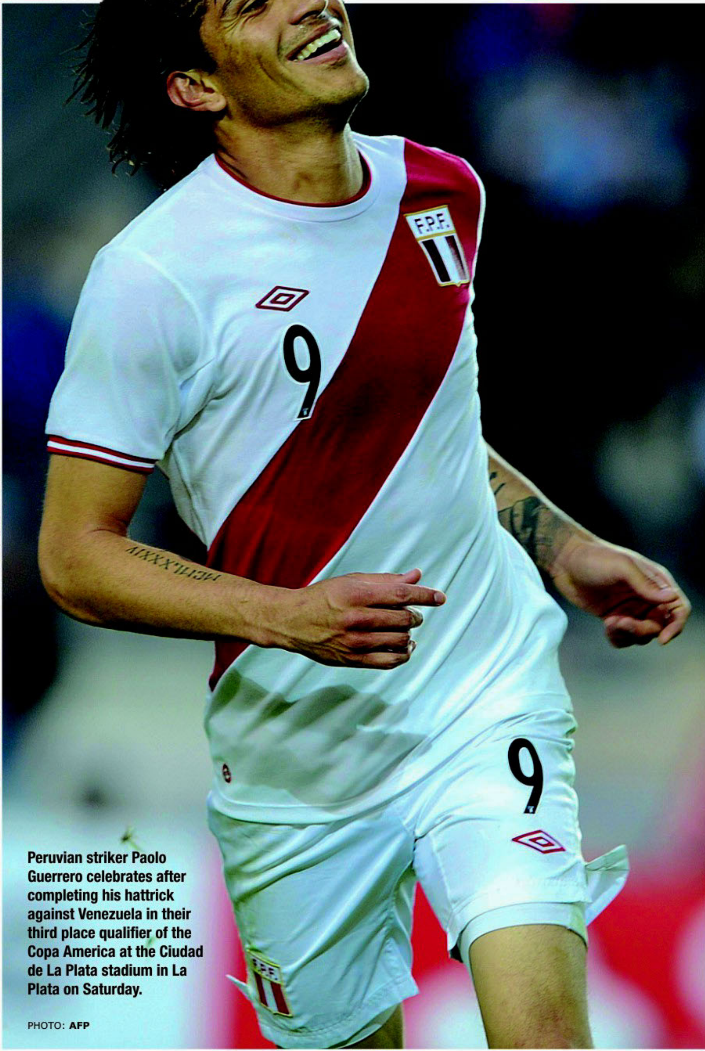
Peruvian striker Paolo Guerrero celebrates after completing his hat-trick against Venezuela in their third place qualifier of the Copa America at the Ciudad de La Plata stadium in La Plata on Saturday.