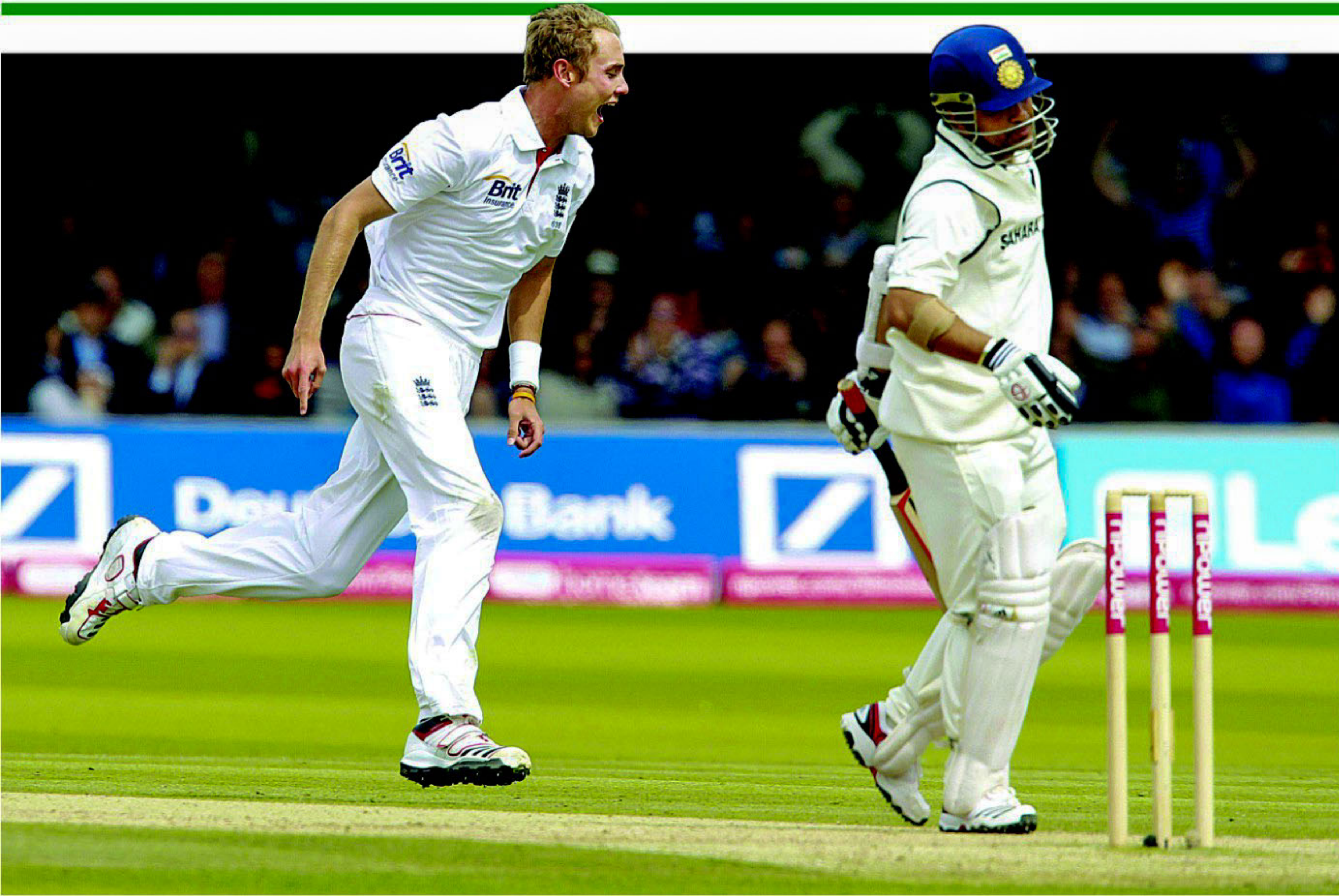
BROAD SMILES NOT FOR TENDULKAR: England fast bowler Stuart Broad (L) is ecstatic after claiming the prized wicket of India batsman Sachin Tendulkar, who could not better his Lord's high of 37, during the third day of the first Test at Lord's yesterday.