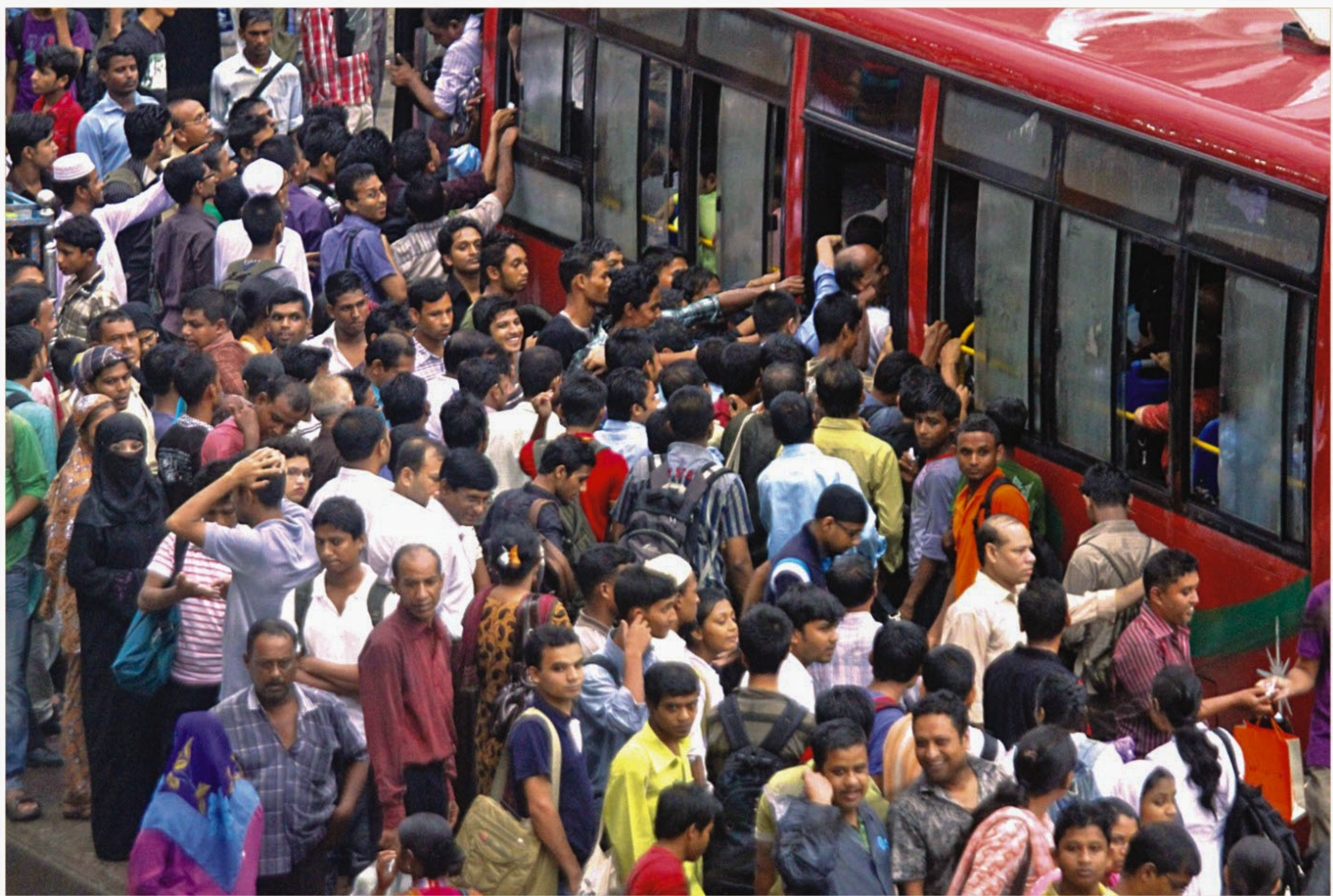
City dwellers at Farmgate yesterday elbow each other to get into a bus which is already full. Every day in the evening thousands of office goers come down to the streets to go home and all that waits for them is this struggle. Those fit enough to get into the few buses that arrive still have to suffer. For some it takes several hours to reach home in the evening rush.